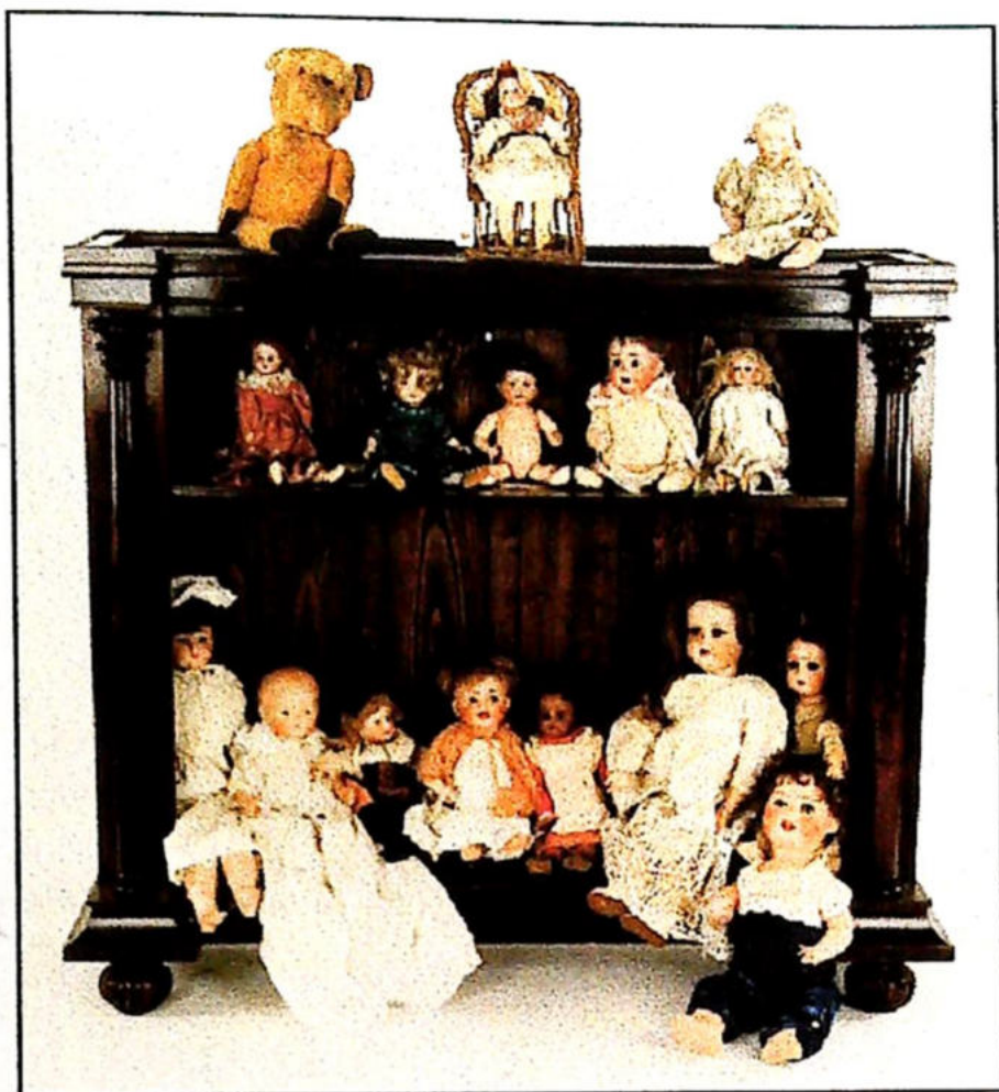
Lot 624 (bookcase)