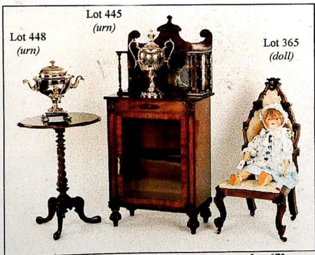
Lot 448 (urn)