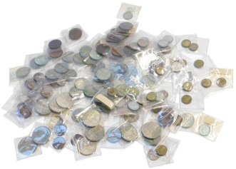
Pre decimal silver, part silver and other coinage, to include commemorative crowns, George V and later threepences, half crowns, shillings, some copper coinage, etc.. SOLD for £360