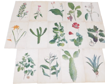
Persian School (19thC). Botanical studies, watercolour, some titled. SOLD for £6,000