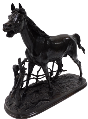
After Pierre Jules Mene (1810-1879). 'Djinn' - Cheval a la Barriere, horse beside a fence, 30cm high, 42.5cm wide. SOLD for £1,200