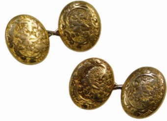
A pair of double oval and chain link cufflinks, with engraved floral and foliate decoration, yellow metal stamped 15ct, 6.3g. SOLD for £340