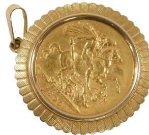
A Queen Victoria gold sovereign 1895, in a 9ct gold pendant mount. SOLD for £675