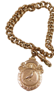
A 9ct rose gold racing pigeon bracelet, with lobster link clasp. SOLD for £1,200