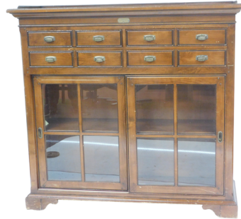
A shop retail design cabinet, with an arrangement of four double fronted drawers, over two sliding doors on bracket feet. SOLD for £260