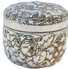
A William IV silver jar and cover, of cylindrical form embossed with flowers, leaves, etc., Birmingham 1830 SOLD for £200