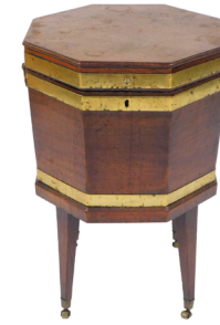
A Georgian III mahogany and brass bound cellarette, the hinged lid enclosing a later steel interior, with two ring handles, raised on square tapering legs, brass capped on castor. SOLD for £300