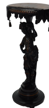
A 19thC carved Venetian blackamoor table, the circular top decorated with drapes with a figural support and circular base with bun feet, 92cm high, 48cm diameter. SOLD for £550