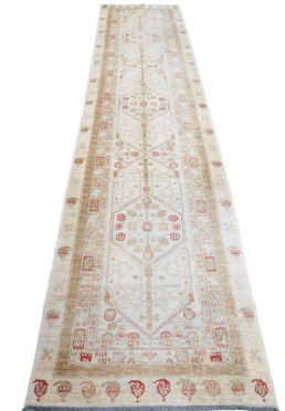
A Persian Scrab cream ground runner, the central field with three floral hexagonal medallions, within repeating floral and boteh filled borders SOLD for £240