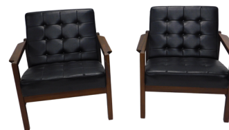
A pair of late 1960s/early 70s teak open armchairs in Danish style, each upholstered in buttoned black leatherette, unmarked, 71cm wide. SOLD for £360