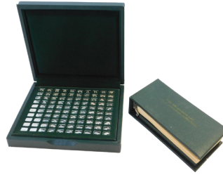
A John Pinches Limited 100 Greatest Cars silver miniature collection, in a fitted case, with booklet, and outer styrofoam box. SOLD for £300