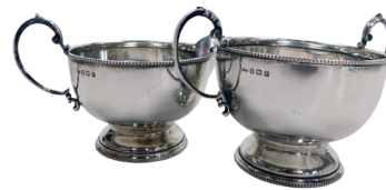
A George V silver cream jug and sugar bowl, with leaf capped double scroll handles, Birmingham 1930, 10.22oz. SOLD for £430