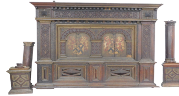
A 19thC Jacobean style oak fire surround, having a dentil moulded cornice with blind fret Arabesque frieze and uprights, enclosing two armoirial panels, over lozenge relief panels, above turned and panelled legs. SOLD for £1,000