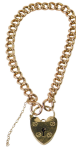
A curb link bracelet, rose coloured yellow metal marked 375, on a 9ct yellow gold heart-shaped padlock clasp, with safety chain. SOLD for £520