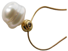
A pearl pendant and chain, the layered pearl set with tiny diamond to clasp, 2cm high, on fine link neck chain, 44cm long, yellow metal stamped 750, 6.8g all in. SOLD for £320