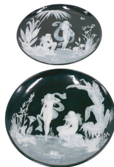
A pair of 19thC George Jones pate sur pate plaques, each decorated with nudes bathing beside water plants, etc., impressed marks to underside SOLD for £850