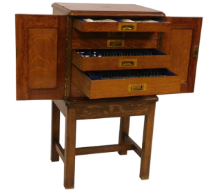
A Victorian silver canteen of cutlery, with an embossed fan shaped terminal, and wave bordered shaft, reserve initial E engraved, contained in a two door, six drawer oak cabinet, with brass shield escutcheons to the lid, raised on a separate table base. SOLD for £9,500