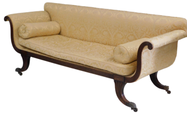
A Regency mahogany scroll arm sofa, with gold damask upholstery, and reeded showframe with cast brass capped castors. SOLD for £550