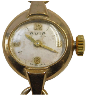
An Avia 9ct gold lady's cocktail watch, the circular dial with baton marks and Arabic numerals at quarters, manual wind, yellow metal marked 375, on a leaf decorated 9ct gold strap, Birmingham 1987, 11.1g all in. SOLD for £300