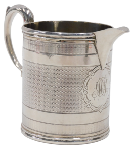
A silver jug, with engine turned decoration, engraved monogram MR, remarked for London 2025, 5.95oz. SOLD for £320