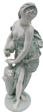
A 19thC Minton part glazed and green Parian figure of Temperance, after Albert Carrier-Belleuse, 68cm high. SOLD for £360