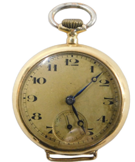
An early 20thC fob watch or watch head, the Arabic numeric circular dial with subsidiary seconds, initial engraved verso, yellow metal marked 18k SOLD for £340