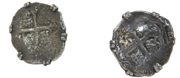
Two 17thC coins, recovered from the Lucayan Beach Pirate Treasure Trove of 1628, converted to cufflinks, with Spink & Son Ltd certificate. SOLD for £260