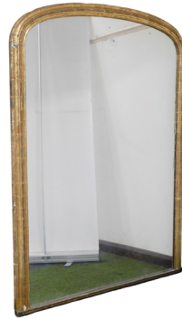
A Victorian gilt overmantel mirror, with a moulded frame SOLD for £220