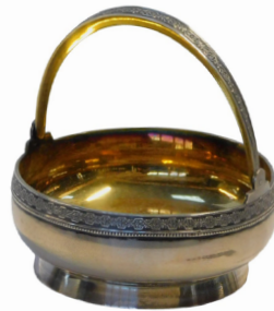
A USSR silver basket, with a gilt interior and swing handle, decorated with scrolling motifs, similarly to the outer rim, raised on a circular foot, stamped 875, 10.5cm diameter, 4.91oz SOLD for £210