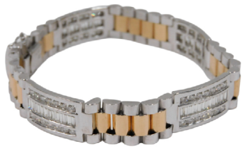
A diamond set bracelet, of bicolour chain link design, with four diamond set panels, each with thirteen baguette cut diamonds SOLD for £3,000