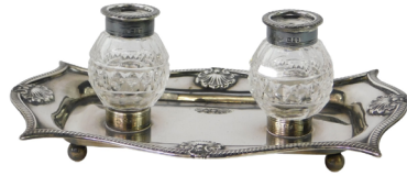
An Edward VII silver desk stand, of shaped rectangular form with a gadrooned border and scallop shell decoration at quarters, containing two cut glass ink pots with silver collars with gadrooned borders, London 1904, the base raised on four ball feet, William Hutton & Sons Ltd, London 1902 SOLD for £200