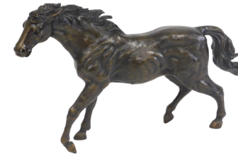
A cast bronze figure of a standing horse. SOLD for £320