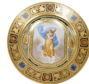
A Vienna style porcelain plate, decorated centrally with a lady with bird floating within brown, blue and red and gilt borders, stylised marks to the underside. SOLD for £550