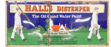
An early 20thC Hall's Distemper enamel sign, the oil-bound water paint, by Sissons Brothers Co. Ltd. Hull. SOLD for £280