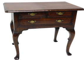
An early 18thC walnut lowboy, the rectangular quarter veneered top with a crossbanded border and a moulded edge, above two short and one long drawer, on cabriole legs and pad feet. SOLD for £380