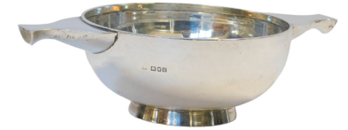
A George V silver quaiche, of plain form, raised on a circular foot, stamped A&J Smith Aberdeen, London 1927. SOLD for £550