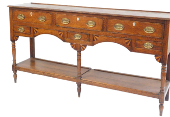
A Georgian oak and inlaid dresser base, the top with a moulded edge with low raise back section, the base with three long drawers with ivory keyholes above three smaller drawers, the under tier united by turned columns, on turned feet SOLD for £700