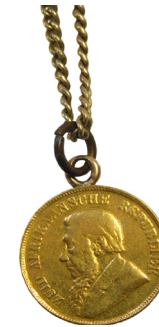
A South African one pond coin dated 1898, on a curb link long guard muff chain, with a collar stamped 9ct, and a base metal T-bar. SOLD for £1,100