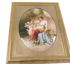
A Vienna porcelain oval plaque, painted with a figure beside cupid within a country house landscape with pillars, etc., oval framed in gilt titled to the reverse, Der Probepeihl, 45cm x 36cm. SOLD for £2,100