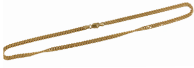
A curb link neckchain, on a lobster claw clasp, yellow metal stamped 375 SOLD for £380