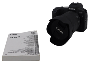
A Canon EOS R camera, with a Canon 67mm RF24-105mm lens, in Lower Pro material carry case with EOS R manual. SOLD for £420