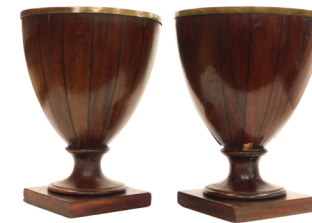
A pair of Edwardian mahogany planters, of circular tapering footed form, with lead liners, raised on a square base. SOLD for £320