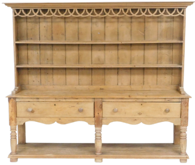
A Victorian stripped pine dresser, with a plate rack top, having a moulded cornice, fretwork frieze, two plate shelves to the rack, the base having two frieze drawers, with cupid's bow shaped apron, on turned legs, and pot board. SOLD for £440