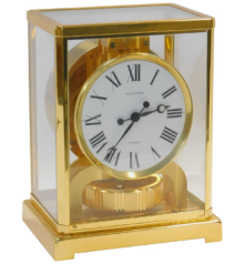
A Jaeger-LeCoultre brass cased Atmos clock, with a circular white enamel dial, bearing Roman numerals, 22cm high, with a pamphlet, Starting the Atmos Clock. SOLD for £480