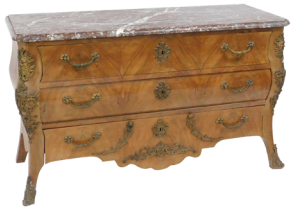
A 19thC continental walnut chest, of three long drawers, with gilt brass loop handles and applied decoration to the frieze, and bombe legs, and having a grey and liver marble moulded top. SOLD for £600