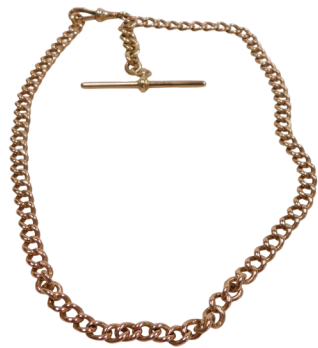
A 9ct gold rose gold curb link albert chain, with lobster claw clasp and T bar as fitted. SOLD for £1,250