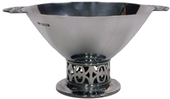
A George V silver twin handle footed bowl, the handles with pierced decoration, on a tapering bowl, and pierced circular foot, Mappin & Webb, Sheffield 1924. SOLD for £230