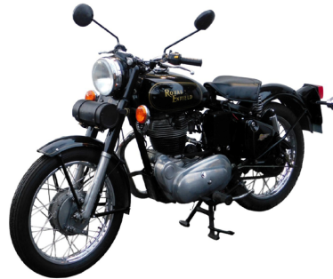
A 2002 Royal Enfield Bullet 500 motorcycle, Registration AK02 HYT, 500cc, petrol, black, 13,948km, MOT until 6/11/2026, currently SORN, V5 present with previous MOTs, invoices and number plate. SOLD for £1,400