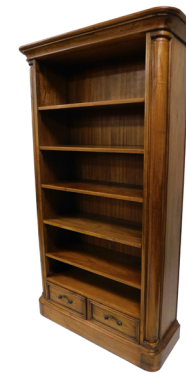
A walnut finish open bookcase, with a moulded top, adjustable shelves, and two drawer base on a plinth. SOLD for £320