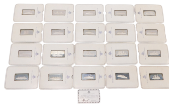
A set of twenty Birmingham Mint solid sterling silver ingots, limited edition of 3000, recalling the History of the Great Liners of the North Atlantic, each in presentation sleeve, in a ship's chest. SOLD for £1,100