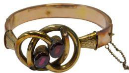
A Victorian bangle, with two oval garnets bezel set in a knot design, on bright cut flower head and leaf decorated shoulders, on a hinged plain bangle, the bangle yellow metal, the design Pinchbeck, with safety chain, 14g all in. SOLD for £400