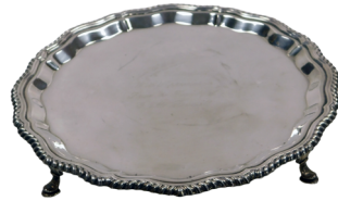
An Elizabeth II silver salver, with a pie crust border and gadrooned rim, raised on four hoof feet, centrally stamped and hallmarked. SOLD for £480