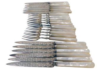
A set of twelve Victorian silver fruit knives and forks, with mother of pearl handles, the knives with floral engraving, Martin, Hall & Co, Sheffield 1896 SOLD for £440