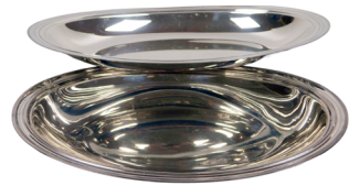
A pair of continental oval salvers, engraved Leo Adams, 7588, white metal stamped 835, 5.83oz. SOLD for £230