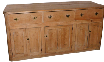
A Victorian stripped pine kitchen or dairy dresser base, with an arrangement of three drawers over three two-door cupboards, with brass solid back plate, and loop handles. SOLD for £900