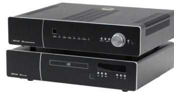
A Roksan K3 CD player, serial number 0450273, together with a K3 integrated amplifier, serial number 0200788, with leads. SOLD for £380