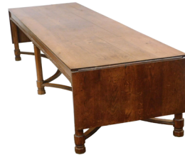
An early 20thC oak extending table, made to match Lot One in this sale, being a boarded top with drop leaves, plain frieze, six octagonal legs, with shaped and curved moulded stretchers. SOLD for £1,800