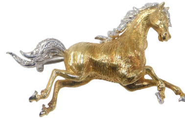
An 18ct yellow and white gold and diamond brooch, modelled as a galloping horse, the mane and forelock set with six eight-cut diamonds, the tail set with ten eight-cut diamonds, each approximately 0.005ct, Cropp and Farr, London 1974. SOLD for £700