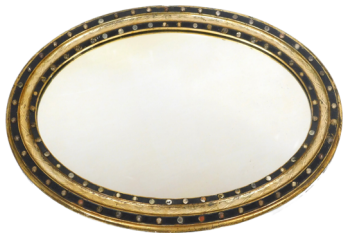
A 19thC Irish mahogany oval wall mirror, with a parcel gilt and jewelled ebonised frame. SOLD for £420