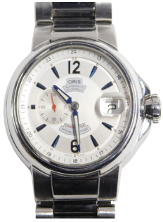
An Oris gentleman's automatic twenty-seven jewel chronometer wristwatch, the dial bearing Arabic numerals at halves, with baton markers, subsidiary seconds and date aperture, numbered verso 0802684, on a stainless steel bracelet strap, boxed with additional paperwork, etc. SOLD for £340