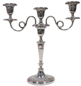
A George VI silver candelabrum, on tapered column bearing the initials MK, on oval weighted base, maker EBS Limited, Birmingham 1939. SOLD for £1,200