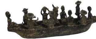
A Benin style bronze tribal boat, mounted with various figures. SOLD for £320