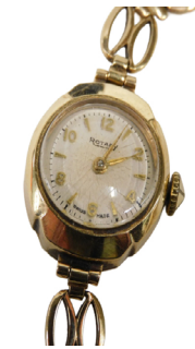
A 9ct gold Rotary ladies' wristwatch, the silvered batoned dial in an oval case, with 9ct gold bracelet, 1.5cm wide, with safety chain, 12g all in, in an F. Hinds Ltd fitted box. SOLD for £320