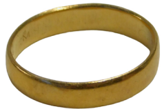
A 22ct gold wedding band, engraved to interior, London 1931, misshapen, size O, 3mm width, 3.1g. SOLD for £250