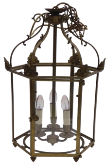
An early 20thC brass framed hexagonal hall lantern, with a three light central column, and clear glass panels. SOLD for £220