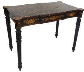
A 19thC floral marquetry ebonised centre table, with a quarter veneered top, having flowerheads and trailing foliage within scrolls of hairwood, satinwood, and mahogany, with a stepped frieze, having similar decoration and part fluted tapered legs. SOLD for £300