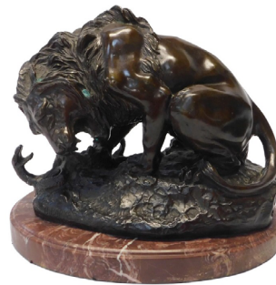
Antoine-Louis Barye (French, 1795-1875). Lion and Serpent, bronze, signed, on an oval variegated red marble base. SOLD for £320