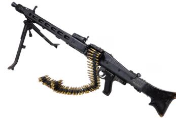
A deactivated Yugoslavian state issue light machine gun, calibre 7.92mm, serial number P49462, with deactivation certificate from The Birmingham Gun Barrel Proof House, issued 06/03/20, number 154579. SOLD for £460