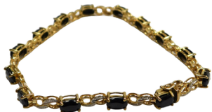
A sapphire and diamond set figure of eight link bracelet, on a snap clasp, yellow metal, stamped 9ct. SOLD for £220