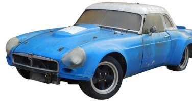
An MGCC MGB V8 built to BCV8 Regulations, (old-wing/wheel spec), blue and white. SOLD for £1,800