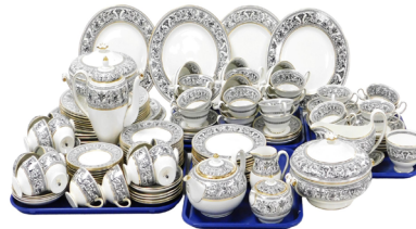
A Wedgwood porcelain Florentine pattern dinner, tea and coffee service, including a pair of vegetable tureens and covers, three oval meat platters, twelve dinner plates, together with dessert and side plates, soup cups and saucers, gravy boat, coffee pot, teapot, sucrier, teacups, etc. SOLD for £650