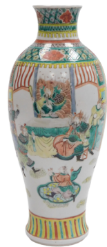
A Chinese famille verte porcelain vase, of baluster form, decorated with an Emperor, warriors and attendants, in a garden, within floral and geometric borders, spurious six character Kangxi mark. SOLD for £240