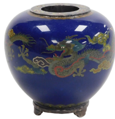
Namikawa Yasuyuki (Japanese 1845-1927). A silver wire cloisonne jar, the rounded squat body worked in silver wire with two chasing dragons on a mid blue ground, the base with applied silver signature tablet Kyoto Manikawa. SOLD for £1,400