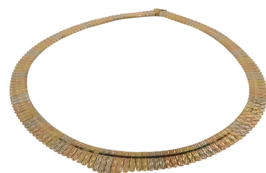
A 20thC tricolour fan necklace, with white rose and yellow gold textured fan design, yellow metal stamped 750 to clasp. SOLD for £2,800