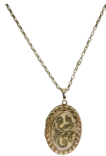
A 9ct gold locket pendant and chain, the oval locket with central floral scroll detail, on a curb link neck chain, yellow metal stamped 375. SOLD for £440