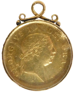
A George III half guinea coin, mounted in a pendant and glass frame, stamped 9ct, 2.5cm diameter. SOLD for £600