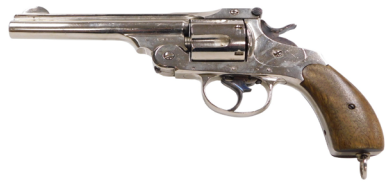
A Smith & Wesson type replica .38 calibre blank firing revolver, with chrome finish, 25cm long overall. SOLD for £800