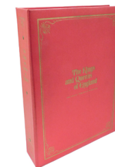
A John Pinches (Medallists) Ltd King's and Queens of England silver proof coin collection set, in presentation ring binder, with certification card. SOLD for £1,100