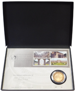
A Royal Mint & Royal Mail Remembrance gold coin first day cover, 1939-1945 In Remembrance of the Second World War, limited edition 43 of 50. SOLD for £2,600