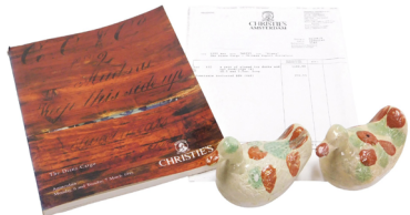
A pair of early 19thC Chinese glazed pottery ducks, 12.5cm wide, from The Diana Cargo previously sold at Christie's March 1995, with a catalogue from that sale. SOLD for £260