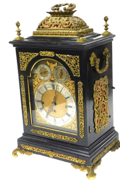
A Victorian ebonised table clock by Jenkinson & Sons, of Retford & Newark, with pendulum and keys. SOLD for £1,200