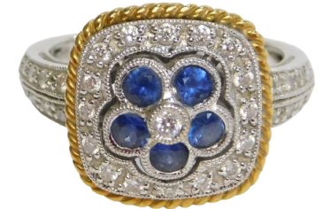
An 18ct white gold sapphire and diamond flower head ring, the central five petalled flower in a surround of brilliant cut diamonds, within a rope twist border, with diamond set shoulders. SOLD for £400