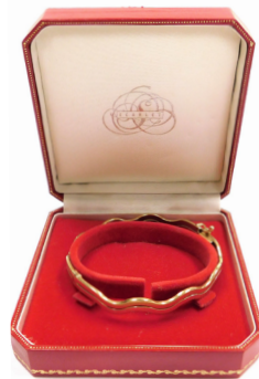
A bi-colour wavy link bracelet, on a snap clasp, stamped 375. SOLD for £260