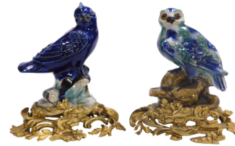
A matched pair of Chinese Qing dynasty porcelain figures of birds, one a parrot, the other an owl, each modelled perched on a rock, each on matching French ormolu rococo style foliate stands, probably early 19th century. SOLD for £1,500