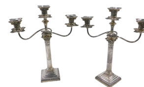
A pair of Victorian silver candelabra, the Corinthian acanthus leaf stepped columns, maker Hawksworth, Eyre & Co, 44cm high. Sheffield 1899, on weighted bases. SOLD for £2,200