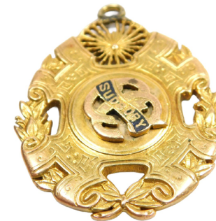
A 9ct gold and enamel sporting medallion, marked to the front Sudbury CC, reverse engraved, first prize 7 mile road race, won by W G Nockales. SOLD for £330