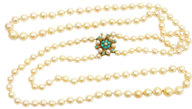
A sapphire and diamond set figure of eight link bracelet, on a snap clasp, yellow metal, stamped 9ct. SOLD for £320