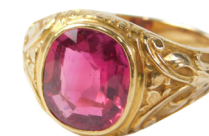
An Edwardian signet ring, set with a pale pink stone, with scroll design shoulders, yellow metal stamped 585. SOLD for £600