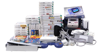
A Nintendo Wii, model no. RVL-001, together with controllers, power supply, assorted games, including New Super Mario Bros, Telly Adicts, The Age of Empire, Star Wars: The Clone Wars, and The Pirates of the Caribbean, and a Nintendo Game Boy. SOLD for £220