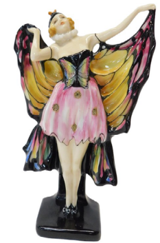
A Royal Doulton figure modelled as Butterfly, HN719, green printed and black painted marks. SOLD for £700