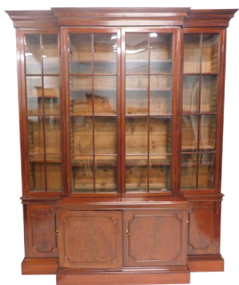
A late 19th/early 20thC mahogany breakfront bookcase in George III style, the top with a moulded cornice above four glazed doors, each with rectangular astragals, the base with four raised panelled doors on a plinth. SOLD for £1,400