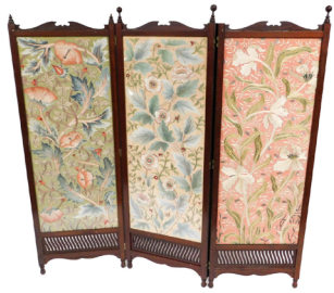
A sapphire and diamond set figure of eight link bracelet, on a snap clasp, yellow metal, stamped 9ct. SOLD for £2,400