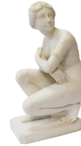
A 20thC marble figure, modelled as a crouching Venus, on a rectangular canted base, 72cm high. SOLD for £220