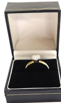
A 9ct gold and enamel sporting medallion, marked to the front Sudbury CC, reverse engraved, first prize 7 mile road race, won by W G Nockales. SOLD for £700