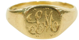
An 18ct gold signet ring, monogram engraved, size O. SOLD for £300