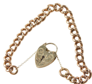
A 9ct gold curb link bracelet, with safety chain and engraved heart shaped padlock. SOLD for £700