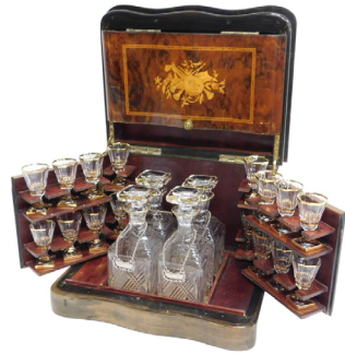
A Victorian walnut and marquetry inlaid drinks cabinet, the hinged top and front panel inlaid with musical instruments and flowers, enclosing four cut glass and gilt heightened decanters with labels, together with sixteen glasses, gilt heightened. SOLD for £300