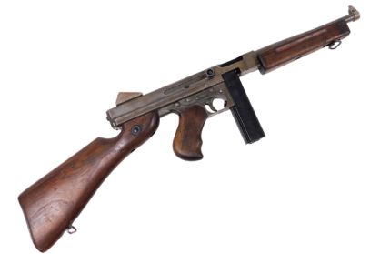
By Tender. A deactivated USA Thompson sub machine gun, calibre .45", serial number 359289, with deactivation certificate from The Birmingham Gun Barrel Proof House, no 150355, dated 12/03/2019. SOLD £650