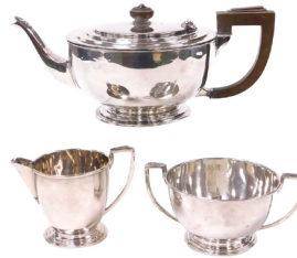
A George V Art Deco silver three piece tea set, comprising teapot, cream jug and sugar bowl, Goldsmiths & Silversmiths Co. Ltd., London 1935. SOLD for £510