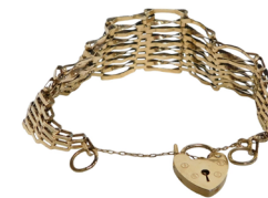
A 9ct gold gate bracelet, of nine bar design, with safety chain and padlock. SOLD for £500