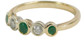
An emerald and diamond five stone ring, yellow metal, marked 375, size N½, 2.2g all in, boxed. SOLD for £220