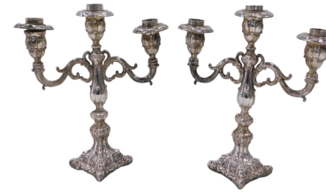
A pair of Peruvian white metal three branch candelabra, cast with scrolls, etc., on a square weighted base, 23cm high. SOLD for £380