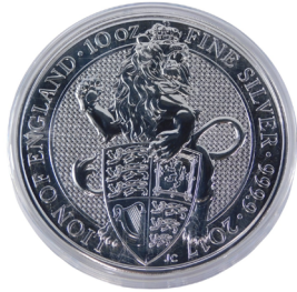
An Elizabeth II 2017 ten ounce fine silver coin, Lion of England. SOLD for £240