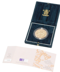
A United Kingdom Brilliant Uncirculated Elizabeth II 2000 gold five pound coin. SOLD £2,200