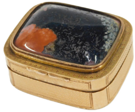
A George III 18ct gold rectangular vinaigrette, the hinged lid inset with an agate enclosing an interior, with a pierced grill, decorated with flowers and scrolls, London 1818, by Giles Loyer, 30.5g all in. SOLD for £1,200