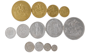
A 1902 specimen coin set, ranging from an Edward VII gold five pound coin, double sovereign, sovereign, half sovereign, crown, etc., in fitted leather case. SOLD for £4,400