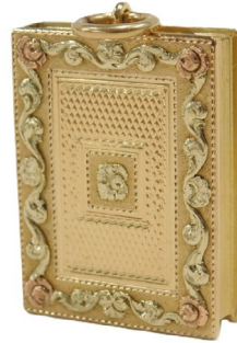
A George IV 18ct rose and yellow gold vinaigrette, the rectangular top with a border of scrolls, surrounding an engine turned centre, hinged to enclose a grill engraved with basket of flowers and leaves, Birmingham 1822, by John Northam SOLD for £1,800