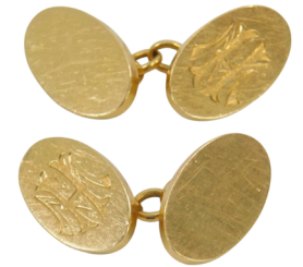
A pair of 18ct gold chain link cufflinks, of oval form, initial engraved, 23g. SOLD for £1,000