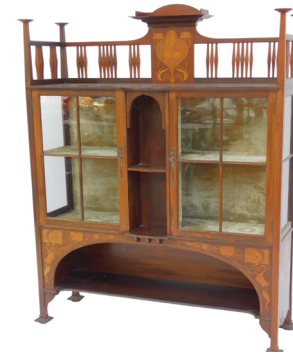
A Shapland and Petter of Barnstable Art Nouveau mahogany and inlaid display cabinet. SOLD for £300