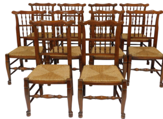
A set of ten 20thC Lancashire style elm dining chairs, each with a spindle back, rush seat, on square legs and pad feet united by stretchers. SOLD for £300