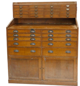
An early 20thC oak apothecary shop or workshop cabinet, the raised back with an arrangement of sixteen small drawers, with brass handles, the base with a black glass top above an arrangement of narrow and deep drawers, each with copper cup shaped handles, on a plinth SOLD for £420