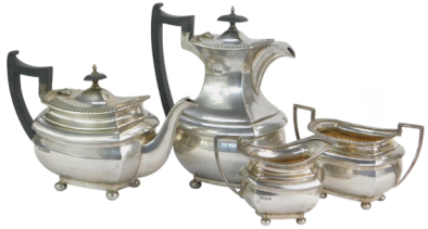
A George V silver four-piece tea service, comprising teapot, hot water jug, twin-handled sugar bowl, and milk jug, each London shaped pieced with a gadrooned border, raised on four ball feet, Walker and Hall, Sheffield 1932, 67.09oz gross. SOLD for £1,100