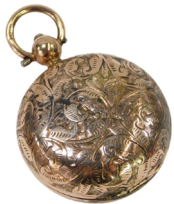
A 9ct gold sovereign case, with shield cartouche initial engraved, bright cut decorated with scrolls, initialled to the interior JH, (AF), 17.5g all in. SOLD for £360