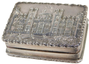
A George IV silver and silver gilt castle top vinaigrette, the rectangular hinge top decorated with a view of Windsor Castle, enclosing a gilt interior, with pierced flower and scroll cover, Birmingham 1827, by Nathaniel Mills SOLD for £500