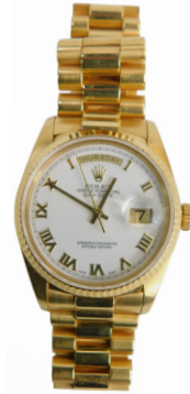
A Rolex gentleman's Oyster Perpetual day date wristwatch, model number 18038, serial number 9142221, yellow metal, marked 750 and 18k, with associated paperwork, a leather bound Rolex notebook, green felted travelling case, and some service records. SOLD for £6,500