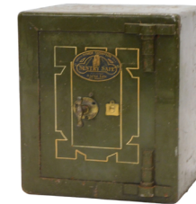
A green painted cast iron Sentry safe, with key SOLD for £260