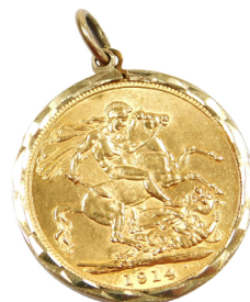
A George V full gold sovereign 1914, in a 9ct gold pendant mount, 9.0g. SOLD for £575