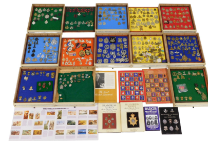
An extensive collection of 19thC and later military cap badges, lapel badges, buttons and sundries, English, Irish, Scottish and Welsh Regiments, RAF, etc, contained in a ten-drawer chest, together with Kipling (Arthur L) and King (Hugh L). Head-Dress Badges of the British Army, 2 vols, published by Muller, further reference works, and Texaco replica badges. SOLD for £220