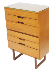
A 1970s Uniflex teak chest of drawers, designed by Gunteher Hoffstead, with an arrangement of six long handled and cushion drawers, raised on U shaped supports. SOLD for £220