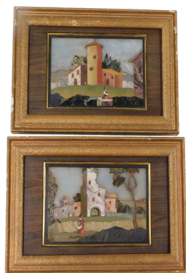
A pair of 18thC Italian pietra dura panels, depicting figures in landscapes, framed, 9cm x 14cm. SOLD for £240