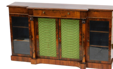
A Victorian rosewood breakfront side cabinet, with one long frieze drawer, above a pair of green silk backed and wirework doors, fronted by foliate capped columns, flanked by a pair of glazed doors, each enclosing two shelves, raised on a plinth base. SOLD for £320