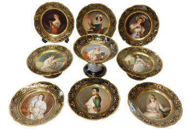
A late 19thC Limoges porcelain part dessert service, outside decorated with portraits, each signed indistinctly, of The Milkmaid Psyche at the water level, Mrs Robinson, Napoleon I, Marie Henrietta of England, Good Night, Madame Lebrun, Vestal Virgin, and Lisette, in a cobalt blue border, gilded and enamelled with reserves of views, roses, foliate scrolls and wreaths, over gilded Limoges and apocryphal Vienna marks, comprising, comport, pair of tazza and six plates. SOLD for £1,900