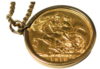
A George V full gold sovereign 1915, in a 9ct gold pendant mount, on a 9ct gold S link neck chain, with a bolt ring clasp. SOLD for £825