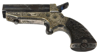
A Tipping & Lawden Sharps Patent .30 four-barreled Derringer pistol, serial no. 4954, with a foliate engraved silver plated frame, bar release and spur trigger, the grip of foliate moulded gutta-percha. SOLD for £320