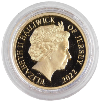
A Westminster Trooping the Colour gold proof one pound coin, dated 2022, limited edition number 140/400, in a fitted case. SOLD for £520