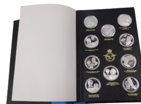
A Royal Air Force Museum Edition History of the Man in Flight silver medal set, containing fifty silver medals, in presentation ring binder with associated certificates in matching ring binders, presented by John Pinches Medallists Limited, in portfolio case. SOLD for £1,900