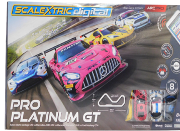
A Scalextric digital Pro Platinum GT set, comprising an Aston Martin Vantage GT3 vs Mercedes AMG GT3 vs Chevrolet Corvette CH.R vs Ford Mustang GT4, boxed. SOLD for £240