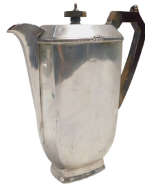
A George VI silver hot water jug, of tapering form, with a reeded border, with a bakelite wooden and angular handle, Stouer and Wragg, Sheffield 1940. SOLD for £625