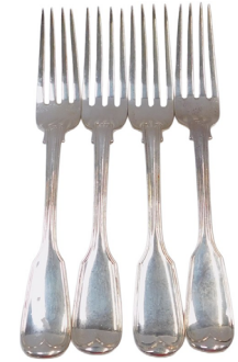
Four Victorian silver Fiddle and Thread pattern table forks, each initial engraved verso, London 1849 and 1858. SOLD for £310