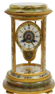
A late 19thC French champleve enamel onyx and gilt brass mantel clock, the circular enamel dial bearing Roman/Arabic numerals, A&N eight day movement with coil strike, the case of cylindrical form, with four glass panels, the dial frame, supports, internal base, outer base top band and circular feet and pendulum, inlaid with champleve enamel, with pendulum and key SOLD for £280