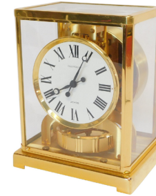
A Jaeger-LeCoultre Atmos brass cased mantel clock, the circular white enamel dial bearing Roman numerals, raised on bracket feet SOLD for £480