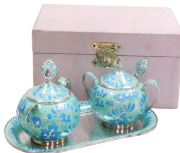
A late 20thC Korean pair of silver and enamel sucriers, with spoons, on an oval tray, decorated in blue, white and turquoise enamels, stamped 999 silver, boxed with certificate SOLD for £280