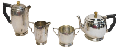
A George VI silver four-piece tea set, of globular form, comprising teapot, hot water, milk jug and sugar bowl, Goldsmiths & Silversmiths Co Ltd, London 1940 SOLD for £1,350