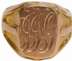
A 9ct rose gold gentleman's signet ring, monogram engraved, with W incised shoulders, size P, Birmingham 1918 SOLD for £205