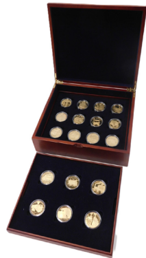
A Royal Mint Golden Age of Steam cased five pound presentation set of silver coins, each with 22ct gold plate, approx 28.28g, comprising eighteen coins, in presentation case with certificates SOLD for £500