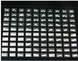
A cased set of vintage car silver ingots, each 0.05oz, in fitted green presentation case. SOLD for £1,600