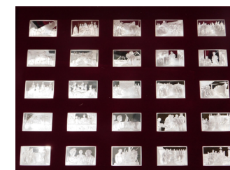
An Elizabeth Our Queen cased presentation silver ingot set, containing twenty five rectangular silver ingots, in presentation case. SOLD for £700