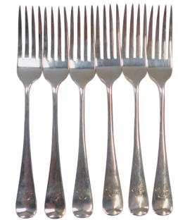
A set of six George V silver Old English pattern dessert forks, initial engraved R, Charles Boyton and Sons Ltd, London 1914 SOLD for £310