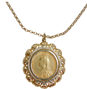
A Queen Victoria full gold sovereign 1888, in a foliate pendant mount, yellow metal, on a belcher link neck chain with bolt ring clasp. SOLD for £920