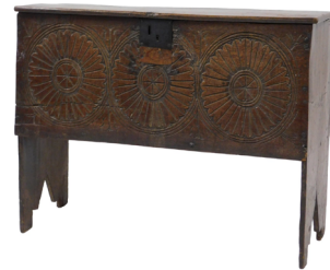
A 17thC oak plank coffer, the hinged lid enclosing a vacant interior with a candle box, the front carved with three roundels raised on V-cut supports. SOLD for £200