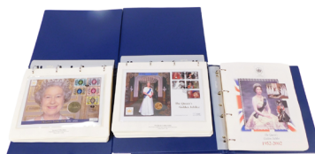
The Queen's Jubilee Coin Cover Collection, in three albums. SOLD for £1,500