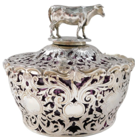
An early Victorian silver butter dish, with pierced decoration overall, the lid with a cow shaped finial, the base with various vacant scroll shaped cartouches, and an associated purple glass liner, London 1838, by Charles Reily & George Storer. SOLD for £480