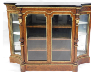
A Victorian kingwood and tulipwood credenza, with an ebonised top and two glass doors to the front with brasswork banding, flanked by turned and part reeded columns, with gilt metal mounts, flanked by concave glass fronted doors enclosing three glass shelves, on a plinth base. SOLD for £750