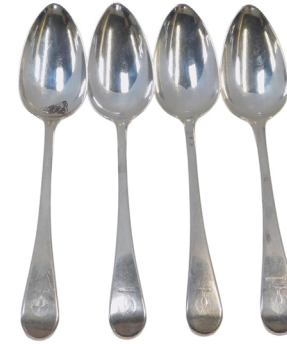
Four William IV silver Old English pattern tablespoons, each handle crest engraved with a peacock, and one engraved with the name Emilius, London 1830 and 1831. SOLD for £220