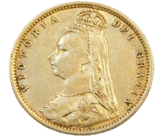
A Queen Victoria half gold shield back sovereign dated 1892. SOLD for £320