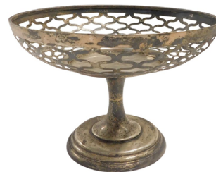
An Edward VII silver pierced pedestal dish, raised on an hourglass-shaped stem and circular stepped base, Birmingham 1909 SOLD for £320