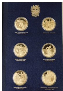
A Churchill Centenary Medals Collection, minted by John Pinches Medallists Limited, Trustee Presentation issue number 4565, issued November 1974 in Commemoration of the 100th Anniversary of the Birth of Winston Churchill, containing twenty four silver gilt medals, in presentation binder, with certificate. SOLD for £650