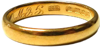
A 22ct gold plain wedding band. SOLD for £300