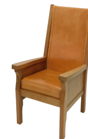
A Robert 'Mouseman' Thompson oak smokers chair, with a tanned leather back and cushion, on square section legs, initialled SA to the seat rail. SOLD for £1,050