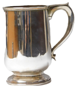
A George V silver tankard, Birmingham 1931. SOLD for £340