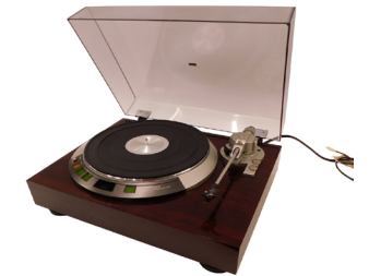
A Denon DP-47L automatic arm lift direct drive turntable system, with rosewood case and smoked perspex cover SOLD for £280