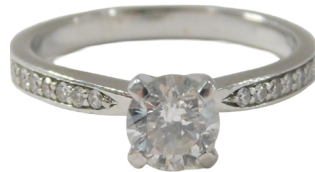
A diamond and platinum ring, with single stone, approximately 0.6ct, the shoulders each mounted with seven small diamonds, 4g all in. SOLD for £360