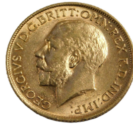
A George V full gold sovereign dated 1913. SOLD for £600