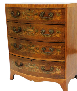
An Edwardian mahogany and kingwood crossbanded bow front chest of four long graduated drawers, with boxwood and ebony line inlay, the drawers marquetry inlaid in satinwood and sycamore, with urns of scrolling leaves and pine cones, mythical sea creatures and drapes emanating from their mouths, raised on outswept bracket feet. SOLD for £460