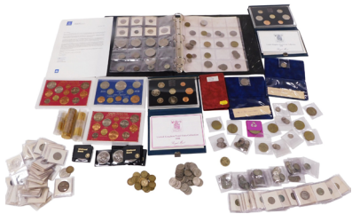
George V and later silver shillings and threepence coins, a Maria Theresa Thaler, Prince Charles and Lady Diana Wedding commemorative crowns, Coinage of Great Britain and Complete Decimal Issue and Last £.S.D coin sets, two United Kingdom Proof Coin Collections 1984 and 1985, and assorted coinage SOLD for £200