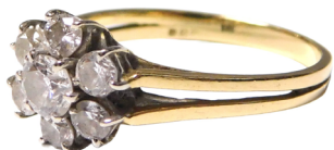
An 18ct gold and diamond seven stone flowerhead ring. SOLD for £220