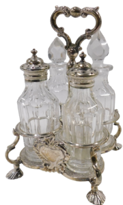
A William IV silver four bottle cruet stand, with engraved rococo scroll and floral decoration, raised on scallop shell feet, Joseph Angell I, London 1834, 13.01oz, with four later cut glass bottles, two with silver lids, Birmingham 1900 SOLD for £260