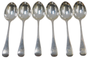
A set of six silver Old English pattern dessert spoons, initial engraved R, Charles Boyton and Son Ltd, London 1914. SOLD for £290