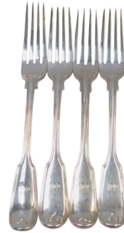
Four 19thC silver Fiddle and Thread pattern table forks, initial engraved, London 1873, 1844, and 1830 SOLD for £310