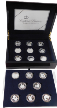
A Royal Mint 80th Birthday of Elizabeth II 2006 silver proof coin collection, limited edition of 25000, containing seventeen silver proof five pound coins, in presentation case with certificates. SOLD for £480