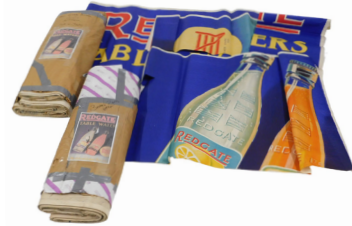
Various billboard posters, to include approx forty Red Gate Table Waters posters. SOLD for £360