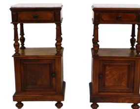
A pair of late 19thC French Louis XIII style walnut bedside cabinets, each with a white marble top over a frieze drawer, raised on four turned columns above a panelled cupboard door, raised on a plinth and turned feet SOLD for £420