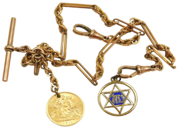
A 9ct rose gold oval and rope twist link watch chain, with two lobster claw clasps and T bar as fitted, with a George V gold half sovereign 1914, and a brass and enamel Masonic pendant. SOLD for £800