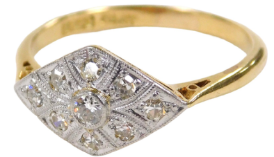
An Art Deco diamond ring, set with a central brilliant cut diamond, in a surround of further diamonds, in a lozenge shaped rub over basket setting, in yellow and white metal, stamped 18ct and plat, size Q½, 2.9g. SOLD for £340