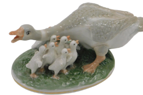
A late 20thC USSR Dulevo porcelain figure of a comotion, a goose with goslings, model by AG Sotnikov, printed mark SOLD for £240