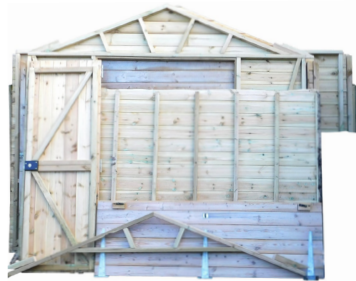
A pine garden shed. SOLD for £200