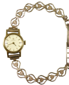
A ladies 9ct gold Omega wristwatch, with pierced 9ct gold strap. SOLD for £300