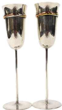
A pair of Turkish Sianisan Cortiere goblets, the bowls with a tri-colour twisted band, being a copy of Cartier goblets, white metal stamped 900. SOLD for £290