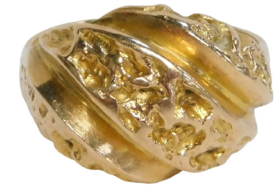
A modernist ring, in a channelled and textured diagonal design, in yellow metal, stamped 585. SOLD for £260