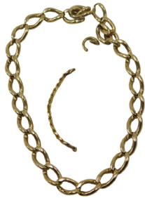
A group of scrap yellow metal, the figaro link chain stamped 375, the other two unmarked. SOLD for £260