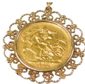
An Edward VII full gold sovereign 1906, in a filigree pendant mount, yellow metal, on a fine curb link neckchain, with bolt ring clasp, stamped 9ct. SOLD for £750