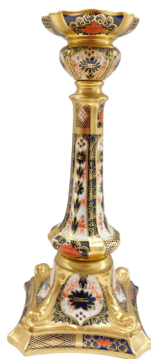
A Royal Crown Derby Imari pattern candlestick, with tapering stem, the square foot decorated with gilt dolphins, printed mark in red to underside SOLD for £260