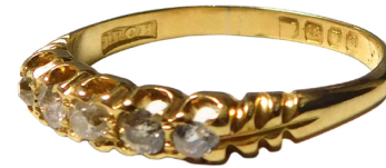
An 18ct gold and diamond five stone ring, set with graduated rose cut diamonds, in a claw setting, size P, London 1902. SOLD for £205