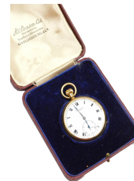
A J W Benson 9ct gold cased gentleman's pocket watch, open face, keyless wind, circular enamel dial bearing Roman numerals, subsidiary seconds dial, Swiss fifteen jewels movement, the case of plain form, cased, London 1934. SOLD for £650