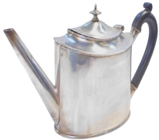
A George V silver teapot, of compressed oval form, Chester 1913. SOLD for £340