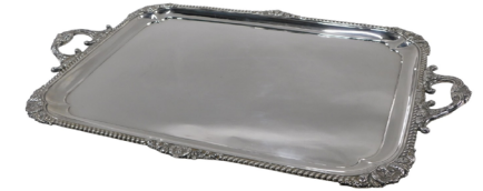
A late Victorian silver two handled tray, with a gadrooned border, decorated with scrolls, shells, etc., to the re-entrant corners, maker Keane & Paul, London 1892 SOLD for £4,800