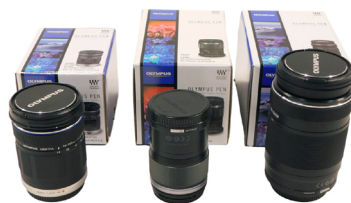
An Olympus digital ED 60mm macro lens, an ED 14-150mm lens, and an ED 75-300mm lens. SOLD for £340