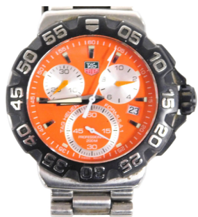
A Tag Heuer Formula 1 stainless steel cased chronograph wristwatch, circular orange dial with baton markers, centre seconds, with three subsidiary dials, black bezel, and winder, serial number CAC1112, on a bracelet strap, with guarantee and instructions, cased and outer boxed. SOLD for £280