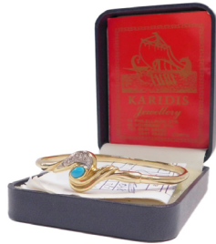
A turquoise and diamond set hinged bangle, the central wave pattern half set with diamonds, and a central oval turquoise, 3cm diameter, the bracelet 6cm diameter, yellow metal unmarked, 9.6g, in a Karids jewellery box of Corfu, with receipt stating 18ct gold. SOLD for £220