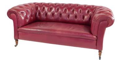
A Victorian Chesterfield sofa, upholstered in later red leather button fabric, raised on mahogany turned legs, on castor SOLD for £525