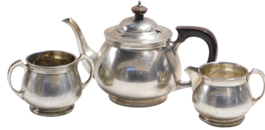
A George V silver three-piece tea set, of globular form, comprising teapot, milk jug and sugar bowl, Mappin & Webb, Sheffield 1926/1927. SOLD for £900