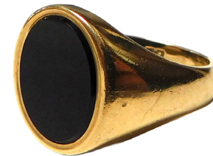
A gentleman's 9ct gold and black onyx signet ring, with a plain oval table. SOLD for £240