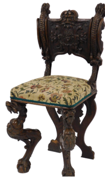
A 19thC Continental carved oak chair, the back carved with dragons, with a cherub's head, green man and floral decorated back, an overstuffed floral upholstered seat, raised on dragon front supports and ball and claw feet. SOLD for £200