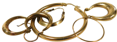
A 9ct gold large hoop earring, a pair of 9ct gold crescent shaped earrings, two further single crescent shaped earrings, and a narrow 9ct gold hoop earring SOLD for £240