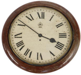
A WWII RAF mahogany cased wall clock, the circular dial bearing Roman numerals and RAF crest, Smiths Astral eight-day movement, bears an Air Ministry stamp and dated 1942, with key and image of the internal movement back plates. SOLD for £420