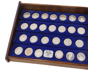
A Royal Mint New Elizabethan Age silver coin set, comprising twenty six Elizabethan Age medallions, in a stepped four layer presentation case with Perspex cover, each medal. SOLD for £1,150