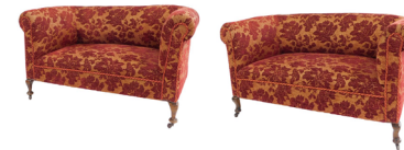
Two similar Victorian two seater sofas, upholstered in red foliate fabric, raised on mahogany legs, on castors. SOLD for £220