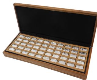
A John Pinches Medallists Limited 1000 Years of British Monarchy silver proof ingot set, containing fifty silver ingots, set number 270, each ingot 2.18oz, with certificate, boxed. SOLD for £3,800