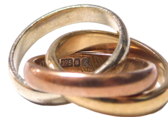
A 9ct three colour gold Russian wedding ring. SOLD for £230