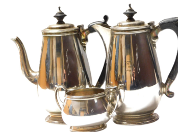
A George V silver three piece coffee set, of pear form, with foliate engraved lids, comprising coffee pot, sugar bowl, and hot milk jug, Edward Barnard & Sons Ltd, London 1934/35 SOLD for £800