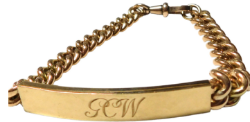
A 9ct gold curb link identity bracelet, monogram engraved GCW, on a lobster claw clasp. SOLD for £1,425