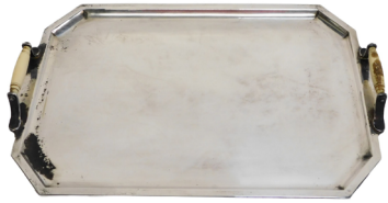
A George VI silver canted rectangular twin handled tray, with ivory turned handles, Goldsmiths & Silversmiths Ltd, London 1938 SOLD for £2,500