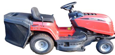
A Mountfield ride on petrol lawn mower, type MP84. SOLD for £320