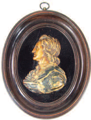
▲ 1239. A 19thC wax profile portrait miniature, of a gentleman quarter side profile in Cromwellian dress, on a glass back in polished oval frame, 10cm x 7cm. £200-300