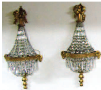
▲ 1243. A Harlequin set of four early 19thC Gustavian neo-Classical crystal and giltwood wall sconces, set with an arrangement of rectangular and octagonal pieces, surmounted by bows and centred by inverted hoops with repeat acanthus mouldings and ram's head terminals, above further leaf mouldings, with plain metal hangers, 86cm high. (4) £300-500