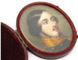
▲ 1248. 19thC British School. Albert, Prince Consort, portrait miniature, watercolour, 6cm x 5cm oval, leather cased and velvet lined. £150-250