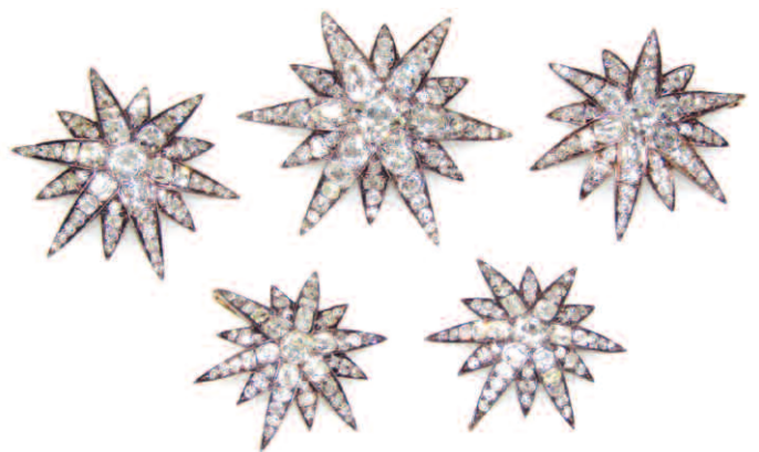
▲ 1245. A set of five Victorian diamond set six point star emblems, one central of 4cm x 4cm, two of 3.5cm x 3.5cm and two of 3cm x 3cm, the largest central square cut diamond of 5.6mm, the radiating arms all set with graduated diamonds of various cuts and sizes, the probable total carat weight between 4 and 5ct, the two medium sized stars with a central diamond of 5.5mm x 5.5mm approx each and the two smallest with a central diamond of 4.5mm approx each, all set with various cuts and sizes, the set was probably once part of a suite consisting of frames for tiara, necklace, earrings, brooch, etc., as each star has a hook fitting and a screw fitting for attachment, but we do not have the frames now. No marks. £4000-6000