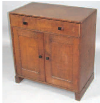
▲ 1241. An early 20thC oak Arts and Crafts Cotswold Gimson style side cabinet, probably from the workshop of Romney Green, Christchurch, Hampshire, with visible dovetails and rounded top, with one frieze draw above double cupboard with carved panels on block supports, 77cm high, 76cm wide, 42cm deep. N.B We are indebted to Mary Greensted and Court Barn for the attribution of this lot. £150-250