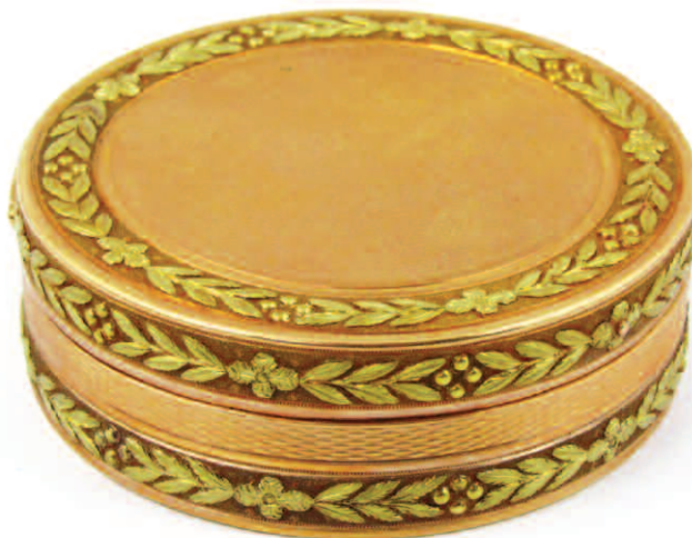
▲ 1250. A George III 18ct gold circular box, with bi-colour engine turned decoration with applied leaf wreath borders, hallmark London 1809, maker AJS, hinged lid, 7cm dia, 140g, in a fitted box. £3500-4500