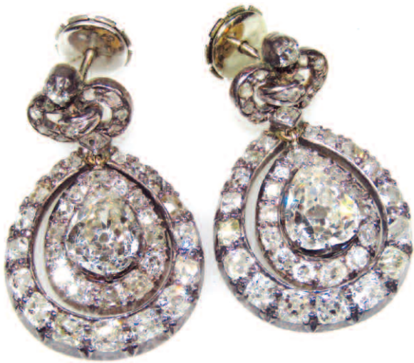
▲ 1246. A pair of 19thC French diamond set pendant earrings, with articulating tear drop centrally set with a diamond of 8.1mm x 7.2mm (widest), surrounded by graduation cushion and eight cut stones, all in white metal fronted yellow gold settings, the ear fixing marked MEGAN PROMIS BREVETE, 22mm x 19mm each. £1200-1500