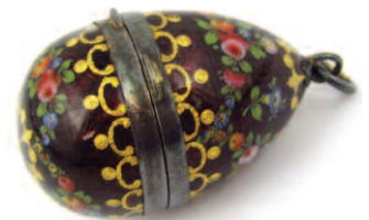
▲ 1256. An Austro-Hungarian enamelled egg shaped pendant, with vinaigrette gilt interior, numerous marks, 24mm x 15mm. £120-180