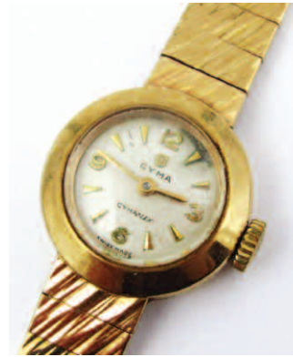
▲ 1252. A ladies 9ct gold cased Cyma Flex bracelet wristwatch, 20.2g all in. £200-250