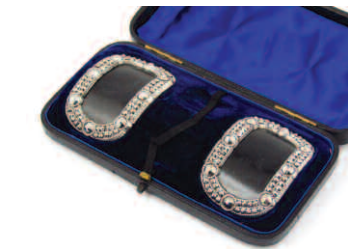
▲ 1249. A pair of Georgian cut steel buckles, in a later fitted case. £100-150