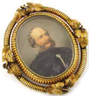
▲ 1247. An oval Victorian memorial portrait brooch of a military gentleman, in a yellow metal frame with hair insert to reverse, the portrait, oil on paper, image 43cm x 34cm £80-120