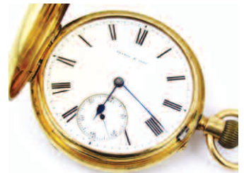
▲ 1255. A late Victorian 18ct gold full hunter pocket watch, inscription to back plate, by Pearce & Sons, (glass missing), initials to reverse and crest to front cover, with inscription 'Presented to C. G. E. Welby, Esq., on the attainment of his majority by his father's rural tenantry 1886', weight all in 105g. £500-700