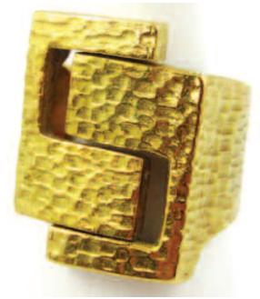
▲ 1253. An 18ct gold 1970's style dress ring, of bark finish, expandable form, 17.6g. £300-400