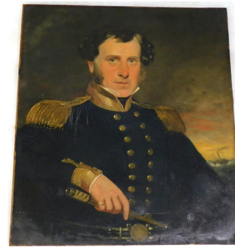
19thC School. Portrait of a naval gentleman, oil on canvas, 76cm x 64cm. SOLD for £340