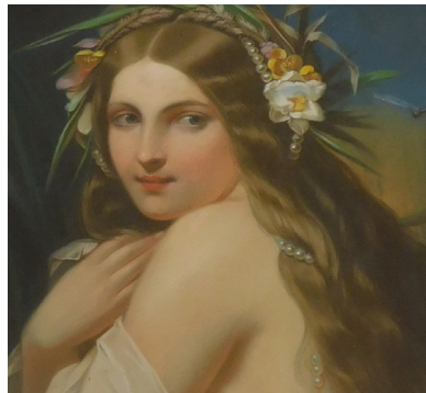
Jules Philipe, The Lady of the Lake pastel, 72cm x 57cm. SOLD for £500