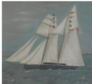
19thC School. Masted ship, oil on canvas, 46cm x 71cm. SOLD for £220