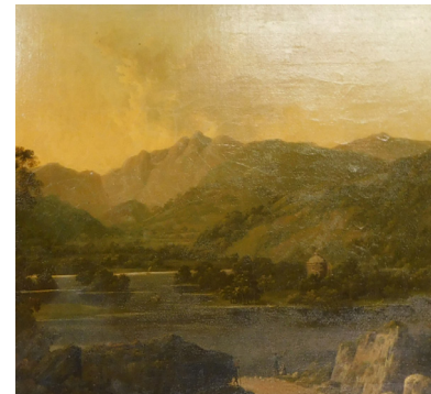
19thC British School. Extensive landscape with figures and lake, oil on canvas, 43cm x 59cm. SOLD for £280