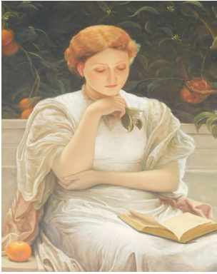
20thC School. Pre-Raphaelite lady, oil on canvas, 89cm x 59cm SOLD for £260