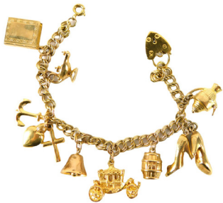
A 9ct gold charm bracelet, set with various charms to include a pair of shoes, barrel, book, anchor, coach, teapot, 20.7g. SOLD for £340