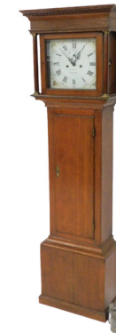
A Georgian oak longcase clock by Jas. Wilson of Stamford, square dial with floral painted spandrels, chapter ring bearing Roman and Arabic numerals, two train eight day movement, with bell strike, the case with out swept pediment with dentil moulding, above a hood sported on two brass capped columns, with plain case, with weights, pendulum and key, 194cm high. SOLD for £550