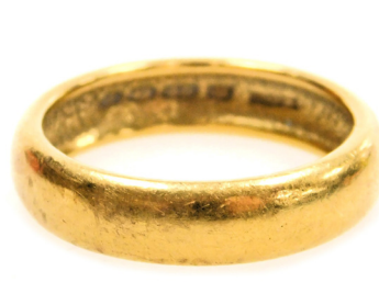
A 22ct gold wedding band, size W, 10.9g. SOLD for £480