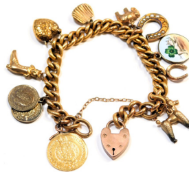
A charm bracelet, the curb link charm bracelet with brushed and hammered links, with safety chain and rose gold padlock, 22cm long, with various 9ct gold charms to include horseshoes, hearts, boot, and a George III 1804 gold groat, 37.4g all in. SOLD for £650