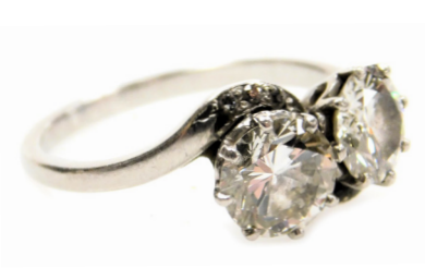
A diamond two stone ring, in a crossover design, with diamond set shoulders, set in white metal, each principle diamond approx 1ct, size N, 4.1g. SOLD for £1,800