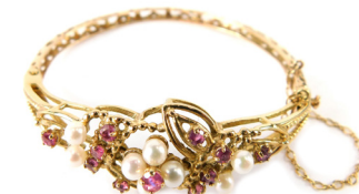
An Edwardian 9ct gold hinged bracelet, inset with rubies and pearls, stamped 375, pierced design with safety chain, 15.1g all in. SOLD for £280