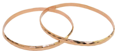
Two hammered rose gold bangles, yellow metal, stamped K14, 7.5cm and 6.5cm diameter, 12.2g. SOLD for £320