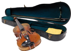
A violin, with a two piece back, bearing spurious Stradivarius label, together with a bow, cased. SOLD £420