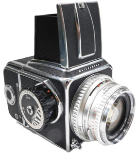
A Hasselblad 500C SLR camera, with a Carl Zeiss Jena 80mm lens, etc. SOLD for £550