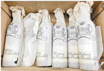
Seven bottles of Chateau Mouton Rothschild 1973 Premier Cru Classe wine, with labels designed after Picasso, associated wooden case. SOLD for £440