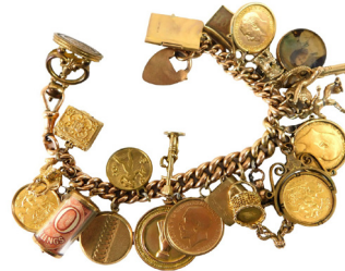
A 9ct gold charm bracelet, applied with various charms, to include 1917 sovereign, 1906 sovereign, 1909 half sovereign, 1918 half sovereign, a 9ct gold and enamel fob related to the Bolsover Colliery Company Limited, awarded for Mansfield Colliery Whist Competition 1924, 1925 half sovereign, charms to include a Bible, gilt metal seal, etc., 143.4g all in. SOLD for £1,300