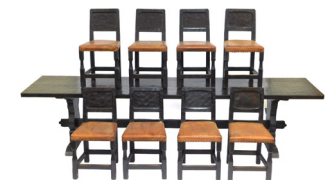
A Thomas Gnomeman Whittaker Yorkshire dark oak dining table and chairs, comprising a three plank refectory dining table, raised on trestle end supports, united by a straight stretcher, 74cm high, 316cm wide, 70cm deep, together with eight dining chairs SOLD for £600