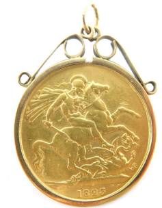
A George IV 1825 gold double sovereign, in 9ct mount, 18.4g all in. SOLD for £875