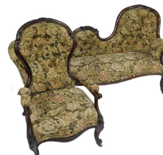
A Victorian mahogany show-frame chaise longue, with scrolling leaf carved back, floral upholstery, on scrolling carved legs with castors, 175cm wide, together with a spoonback matching armchair. SOLD £130