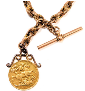
A rose double link gold watch chain, mounted with an Edward VII sovereign, dated 1908, on pendant mount, with T bar and two clips, 40cm long, 34.8g all in. SOLD for £800