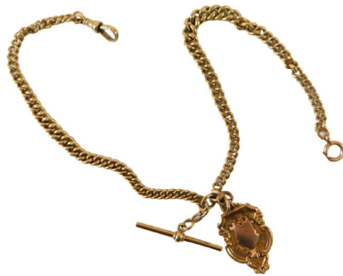
A 9ct gold watch chain, stamped to T bar 375, and a rose coloured gold fob, with vacant cartouche, 40g overall. SOLD for £700