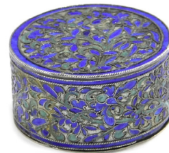
A Chinese white metal and enamel pill box, with inner cover, the enamel decoration in blue and green, 0.94oz, 3cm diameter. SOLD for £200