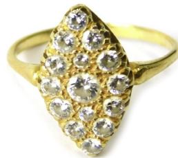
A marquise diamond dress ring, the central marquise set panel with round brilliant cut diamonds, ring size R, metal unmarked, 3.4g all in. SOLD for £260