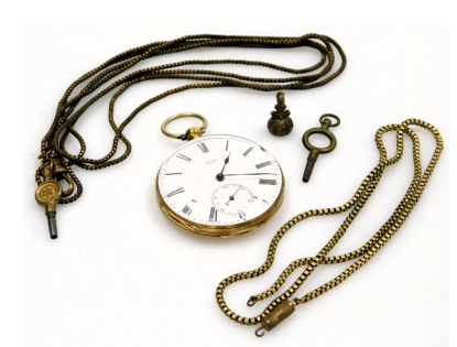
A Baume gentleman's 18ct gold cased pocket watch, open face, key wind, circular enamel dial bearing Roman numerals, subsidiary seconds dial, movement number 3622, base metal cuvette, the case with engine turned decoration, vacant shield and garter reserve, 65.9g all in, together with keys, chains and a fob seal. SOLD for £460