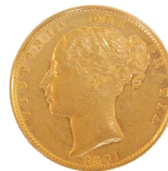
A Young Victoria Head shield back full gold sovereign, dated 1881. SOLD for £420