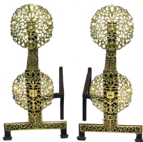
A pair of 19thC brass and wrought iron andirons, in the 17thC style each with two 'Haddon Hall' type pierced and foliate decorated roundels. on swept and floral decorated stems and T-shaped supports, 63cm high. SOLD £650