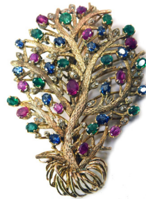
A diamond, emerald, sapphire and ruby brooch, of fruiting tree form, in yellow metal, unmarked, 27.4g, 7cm high. SOLD for £950