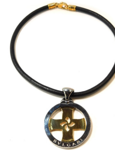
A Bvlgari 18ct gold pendant, with star design centre, No. 3837, 4cm diameter, 24.3g all in, and a Bvlgari leather cord necklace, with 18ct gold clasp. SOLD for £440