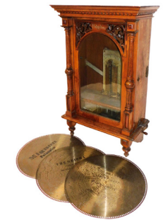
A Victorian mahogany cased polyphon, with an outswept pediment with dental moulding, above an rectangular glazed door, with titled "Polyphon" and carved panel over domed glass, flanked by turned and fluted columns, raised on a plinth above turned feet, penny coin slots to sides, with winder, with thirty two discs, 121cm high, 77cm wide, 39cm deep. SOLD for £2,800