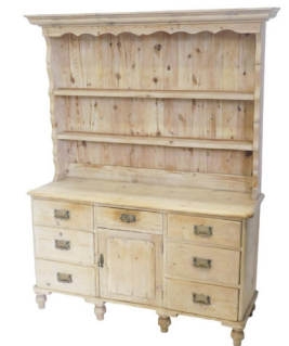
A Victorian pine dresser, the associated raised back with a moulded cornice and two shelves for plates, the base with an arrangement of seven drawers around a central door with arched panel, on turned feet, 184cm high, 135cm wide. SOLD for £220