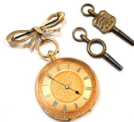
An early 20thC fob watch, in hammered gold case with a vacant cartouche and floral Roman numeric dial with blue hands, yellow metal stamped 18k, bearing serial no. 126155, key wind, on a later 9ct gold bow brooch mount, 4cm wide, 36.9g all in, boxed. SOLD for £320