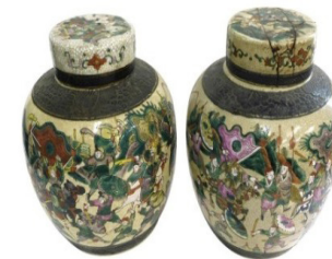
A large near pair of Chinese famille verte ginger jars, each decorated with warriors, etc., in shades of predominantly green, red, and aubergine, on a crackle ground, the lids with similar decoration, one lid AF, 28cm high. SOLD for £200