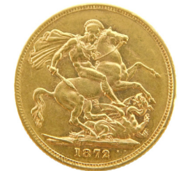
A Queen Victoria 1872 full gold sovereign. SOLD £370