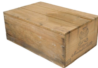
A case of Chateau Mouton Rothschild 1973 wine, case stamped Cubederre. SOLD for £800