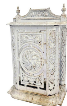
A white painted cast metal umbrella stand in Coalbrookdale style, decorated with vine leaves, floral rosettes, etc., 71cm high, 46cm wide, 22cm deep. SOLD £130