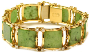
A jade and diamond bracelet, the panel set with square cut jade, round brilliant cut diamonds set over ten sections, yellow metal stamped 18ct, 48.2g all in. SOLD for £1,350