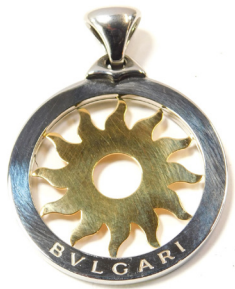
A Bvlgari 18ct gold circular pendant, with sunburst centre, No. 2337A1, 23.8g all in. SOLD for £380