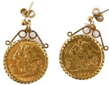
A pair of 9ct gold earrings, each inset with an Edward VII 1905 and a Victorian 1894 gold half sovereign, 10.1g all in. SOLD for £380