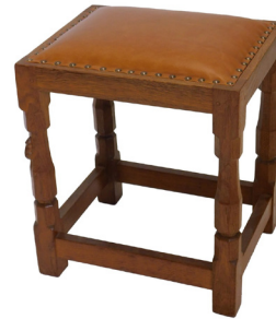
A Robert 'Mouseman' Thompson oak stool, with a brown leather padded top with studded border, chamfered part baluster legs, carved with mouse, 45cm high, 39cm wide. SOLD for £400