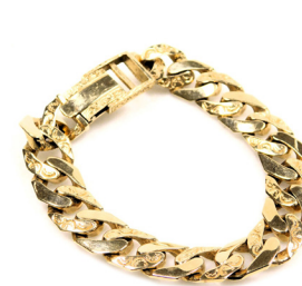
A 9ct gold gentleman's curb link bracelet, with plain and engraved links, on an over clip clasp, 59.4g. SOLD for £1,100