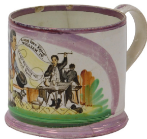
A William IV commemorative Sunderland lustre tankard, painted with John Bull and other figures, with 'Long King William IV', and 'I hope the times will mend Tom', 12cm high. SOLD for £400