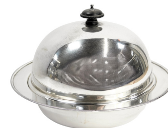
A George V silver muffin dish, with an ebonised knop, James Dixon and Sons, Sheffield 1926, 16.96oz. SOLD for £300