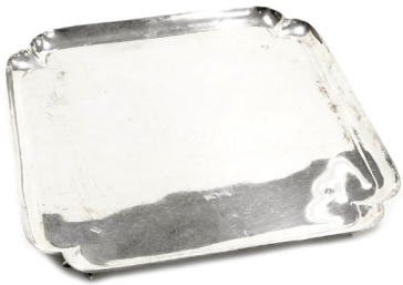
A George VI silver square piecrust salver, raised on angular feet, London 1940, 30.68oz. SOLD for £500