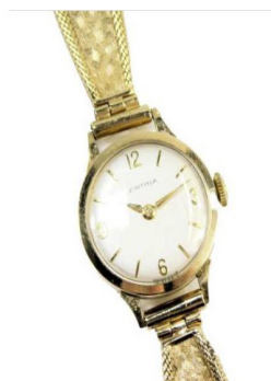
A Certina 9ct gold lady's wristwatch, the small silvered dial with numbered border, on a bark effect design bracelet, with double rope twist border, 18.3g all in, in a Certina box. SOLD £260