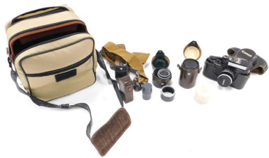
A Canon camera, with lens and various accessories. SOLD for £850