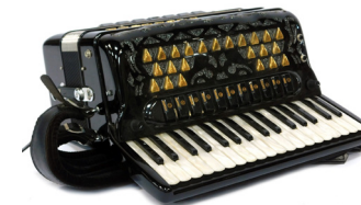
A Brandoni Super Musette piano accordion, in canvas case. SOLD for £800