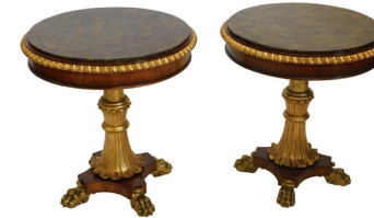
A pair of continental mahogany, simulated marble and gilt occasional tables, each with a circular drum top, a part turned leaf carved column and a concave platform with gilt paw feet, 66cm high, 56cm wide. SOLD for £500