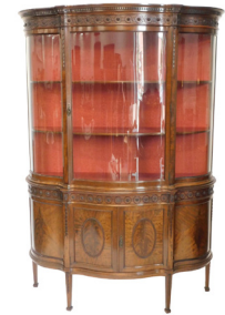
An early 20thC mahogany display cabinet or vitrine, the top with a shaped edge and a frieze carved with oval and circular patera above a serpentine shaped glazed door flanked by shaped sides, enclosing a silk lined interior, the base with two panelled doors, flanked by bell flower motifs, on square tapering legs, 200cm high, 133cm wide. SOLD for £280