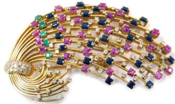
A diamond, ruby, sapphire and emerald brooch, of tied bouquet form, in yellow metal, with safety chain as fitted, unmarked, 29.3g, 7cm wide. SOLD for £1,100