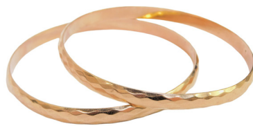
Two hammered design bangles, yellow metal, stamped K14, 7cm diameter, 18.2g all in. SOLD for £480