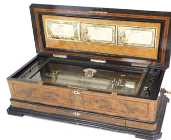
A late 19thC Swiss walnut and ebonised cased music box, with bone escutcheons, playing eighteen aires, the case with mother of pearl inlay, kingwood crossbanding and boxwood line inlay, 95cm wide. SOLD for £1,500