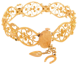
A Continental filigree design bracelet, the oval loops with pierced and scroll design, with shell capped centre, barrel clasp bearing the initials MS, unmarked, 6.5cm diameter, 23.9g. SOLD for £650