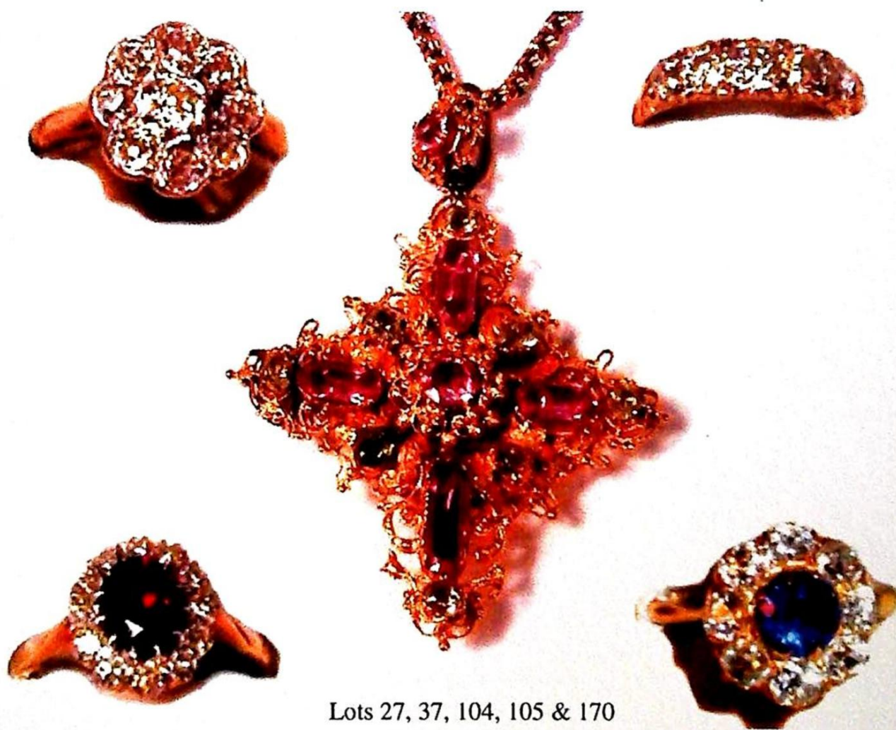
Lots 27, 37, 104, 105 & 170

JEWELLERY & SILVER, GEORGIAN & VICTORIAN FURNITURE, CERAMICS ETC.