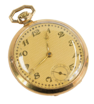
A 9ct gold pocket watch, open face, keyless wind, circular engine turned yellow dial bearing Arabic numerals, subsidiary seconds dial, 41.8g. SOLD for £200