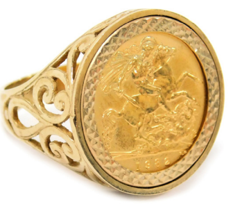
An Elizabeth II gold half sovereign 1982, in a 9ct gold ring mount, size V, 8.8g. SOLD for £250

A Tigers Eye bracelet, set with six links, on a snap clasp, stamped 9ct. SOLD for £200