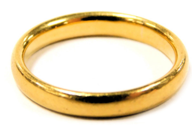
A 22ct gold wedding band, size P, 5.7g. SOLD for £220