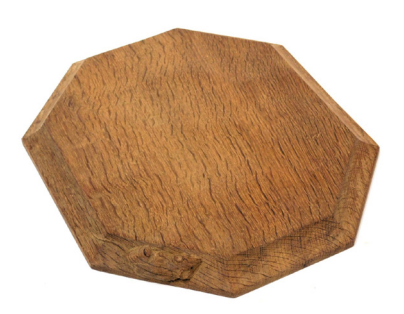
A Robert Thompson of Kilburn 'Mouseman' bread board, of octagonal form, carved to the side with a mouse, 30cm wide, 25cm deep. SOLD for £280