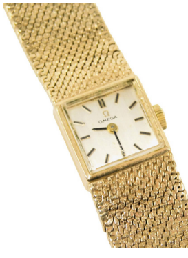
An Omega lady's 9ct gold case wristwatch, square silvered dial with batons, on a 9ct gold strap with snap clasp, 33g all in. SOLD for £500