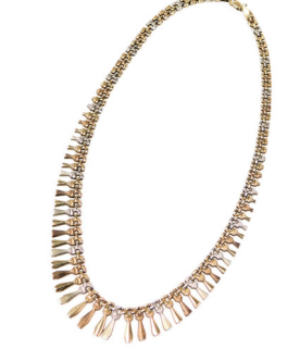
A 9ct three colour gold fringe necklace, on a lobster claw clasp, 15.3g. SOLD for £260

A Tigers Eye bracelet, set with six links, on a snap clasp, stamped 9ct. SOLD for £200