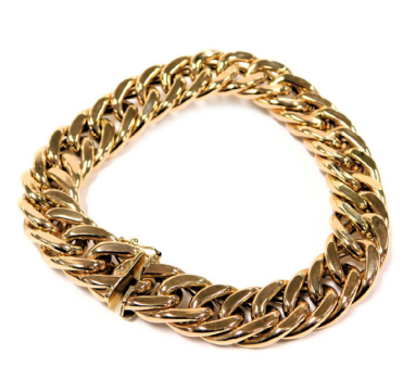
A 9ct gold gentleman's curb link bracelet, on a snap clasp, 35.1g. SOLD for £650