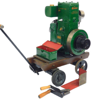
A Lister D Type stationery engine, 1.9hp, mounted to a four wheel trolley, with cranking handles, and accessories. (a quantity) SOLD for £400

A fancy circular link neck chain, yellow and white metal, on a lobster claw clasp, stamped 9kt, 14.7g. SOLD for £240