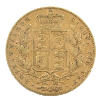
A Queen Victoria young head shield back full gold sovereign, dated 1842. SOLD for £420