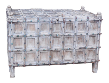
A large 19thC Indian hardwood chest, with multiple panels to sides, top and front, joined by metal mounts, on stiles, 92cm high, 136cm wide, 76cm deep. SOLD for £280

A late 19th/early 20thC oak arts and crafts bureau bookcase, the top with a moulded cornice, above a recess, two astragal glazed doors, with copper tulip shaped hinges, above a panelled fall, two drawers and two doors, flanked to either side by bookcase sections, each with seven shelves, on tapering feet, 199cm high, 111cm wide, 43cm deep. SOLD for £400