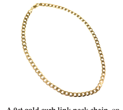
A 9ct gold curb link neck chain, on a lobster claw clasp, 29.5g. SOLD for £500