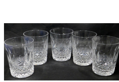
A set of five Waterford crystal Colleen pattern tumblers, 11cm high. SOLD for £320