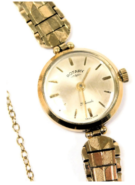
A Rotary lady's 9ct gold cased wristwatch, circular champagne dial with batons, twenty one jewel movement, on a 9ct gold strap, with safety chain as fitted, 16.6g all in. SOLD for £200