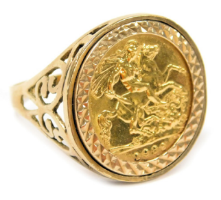
An Elizabeth II gold half sovereign 1982, in a 9ct gold ring mount, size V, 7.3g. SOLD for £240