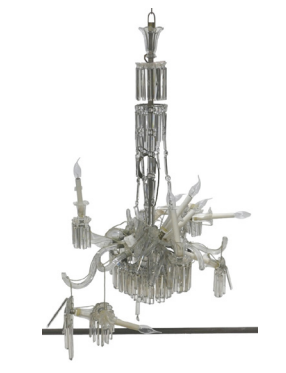
A cut glass chandelier, with ten arms, suspended with cut glass drops, 130cm high. (AF) SOLD for £380