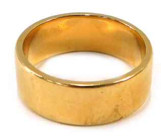
An 18ct gold wedding band, of plain design, maker WW, 9mm width, London 1953, ring size W½, 13.3g. SOLD for £440