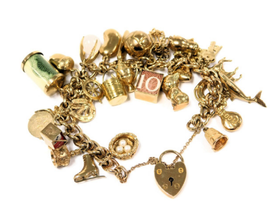
A 9ct gold charm bracelet, with twenty nine charms as fitted, on a heart shaped padlock clasp, with safety chain, 64.3g. SOLD for £1,100