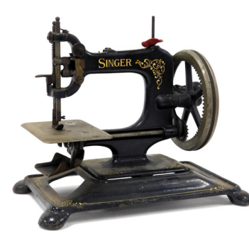
A late 19thC Singer sewing machine, 29cm wide. SOLD for £240