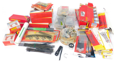
Hornby OO gauge accessories, including track mat accessory packs, track pack systems, single brick bridges, etc. (2 boxes). SOLD for £100