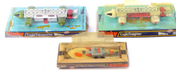
Dinky Toys Space 1999 360 Eagle Freighter, Space 1999 359 Eagle Transporter, and 675 Motor Patrol boat, boxed. (3). SOLD for £160