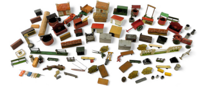
Britain's and other farmyard equipment and accessories, including Dinky Toys motor car, hay bales, well, etc. (1 box). SOLD for £140