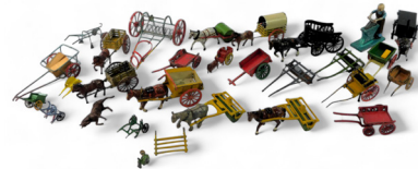
Britain's and other horses, carts and farming implements, etc. (1 box). SOLD for £150