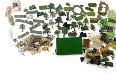
Britain's and other scenic accessories, including trees, flowers, gates, etc. (2 boxes). SOLD for £120