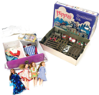
Four 1970s Palitoy Pippa and friends dolls, dressed, together with additional clothing, shoes, hats, clothes hangers, etc., in a pink plastic Pippa case, together with Pippa's Gymkhana Set, boxed. SOLD for £200