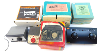
Model railway controllers and accessories, including Gauge Master model Q four track controller, H&M Duet dual control unit, Hornby R900 power control, etc. (1 box). SOLD for £100