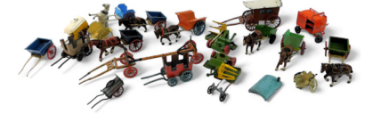
Britain's and other horses and carts, etc. (1 box). SOLD for £150