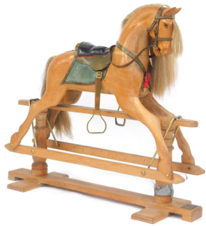
A Stevenson Brothers of England waxed oak rocking horse, No 1011, 1992, with real horse hair mane and tail, green leather saddle and leather bridle. SOLD for £600