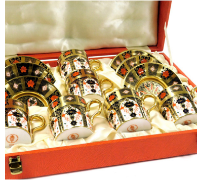
A Royal Crown Derby Imari porcelain gold ground coffee set , pattern no. 1128, comprising six coffee cans and saucers, cased. SOLD for £340