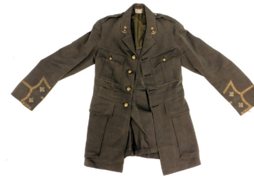
A green Army dress jacket , with applique and military buttons. SOLD for £400