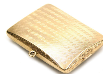
A 9ct gold match sleeve, with engine turned decoration, and foliate engraving, with ring suspension, 28.6g. SOLD for £420