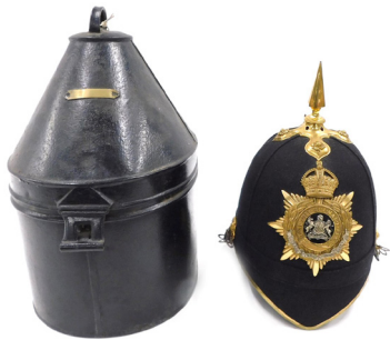
A Victorian Manchester regimental helmet , with a gilt metal spike, in tin travelling case, with vacant plaque. SOLD for £340