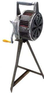
An air raid siren , The Home Office property number serial stamp, on metal base, 82cm high. SOLD for £240