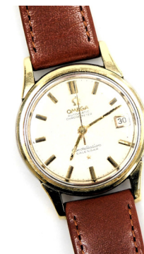
An Omega gentleman's Constellation Calendar gold plated wristwatch, circular champagne dial, centre seconds, date aperture, automatic movement, stainless steel back, on a Hirsch tan leather strap. SOLD for £380