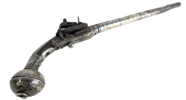
A 19thC Persian white metal and niello decorated pistol , 50cm long. SOLD for £600