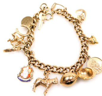
A 9ct gold curb link charm bracelet, with thirteen charms as fitted, on a bolt ring clasp, 34.7g. SOLD for £550