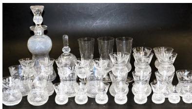
An Edinburgh Crystal Thistle Pattern suite of table glassware , including champagne flutes, red and white wine glasses, whisky and water tumblers, liqueur glasses, a stirrup cup, and a decanter. (34) SOLD for £600