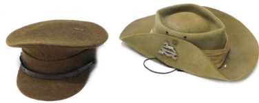
A Royal Artillery cap , and a West Yorkshire Regiment Australian style hat. (2) SOLD for £320