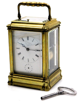
A late 19thC brass repeater carriage clock , by Webster of Cornhill, London, rectangular enamel dial bearing Roman numerals, subsidiary seconds dial, bearing Arabic numerals, twin barrel movement, with bell strike, the case of conventional form, with clock, silent and quarters lever to the base, repeater button to the top, with key, 14cm high. SOLD for £320