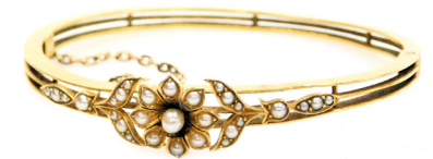
An Edwardian 15ct gold and seed pearl bangle , in a floral and open work design, on a snap clasp, with safety chain as fitted, 13.6g. SOLD for £370