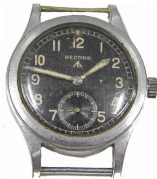
A Record WWII military wristwatch , signed black dial with broad arrow and stainless steel case, marked WWW, and L11378 529225, and subsidiary dial. SOLD for £220