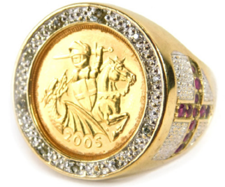
A Queen Elizabeth II St George half gold sovereign ring , the sovereign dated 2005 with warrior on horseback, in a 9ct gold ring mount, set with diamonds to rim and diamonds and rubies to shoulders, formed as the England flag, ring size X½, 10g all in. SOLD for £330