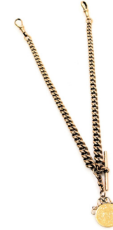
A South African gold one pond coin 1898 , in a yellow metal suspension, on a 9ct rose gold curb link Albert chain, with two lobster claw clasps, and T bar as fitted, 63.1g. SOLD for £1,200