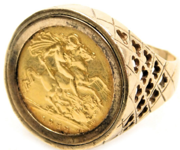
An Elizabeth II gold half sovereign 1982, in a 9ct gold ring mound, cut, approx size U, 11.1g. SOLD for £260