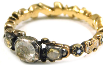
A Victorian memorial dress ring , set with three foil backed old cut imitation diamonds, with enamel work band, with white and black flowers, yellow metal unmarked, ring size O, 4.4g all in. SOLD for £2,400