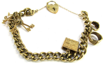
A 9ct gold charm bracelet , the curb link bracelet with safety chain and heart shaped padlock, charms to include book, two rings and keys, 16cm long, 33.3g all in. SOLD for £530