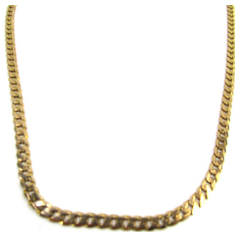
A flat curb link neck chain , yellow metal, stamped 375, 49cm long, 21g. SOLD for £380