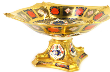
A Royal Crown Derby Old Imari porcelain compot , gold ground, pattern 1128, printed marks, 26cm wide, boxed. SOLD for £850