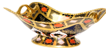
A Royal Crown Derby Imari gold ground porcelain basket , of twin handled, footed form, pattern no. 1128, 28.5cm wide. SOLD for £725