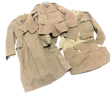
Three Defence Corps and Army jackets . SOLD for £280