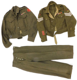
A Royal Artillery green dress uniform , an RHA waistcoat and pair of trousers, with various badges and bars. (1 box) SOLD for £260