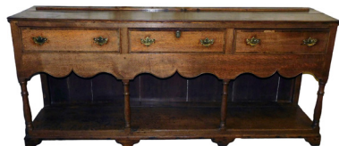
A George III oak and rosewood cross banded dresser base, with three long drawers, above a shaped apron and turned columns, united by an under tier, on ogee bracket feet, 92cm high x 206cm wide x 45.5cm deep. SOLD for £1,000