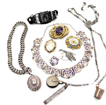
Victorian and later silver and costume jewellery , including a silver locket on chain, jet multi-link bracelet, and a steel chatelaine. (qty) SOLD for £320