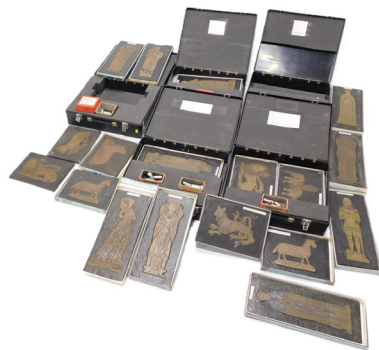
A collection of museum model medieval brass plaques, rubbing sets, etc. , in five fitted cases. SOLD for £320