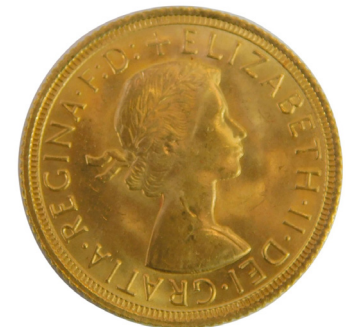
An Elizabeth II full gold sovereign 1966 , in fitted box. SOLD for £355