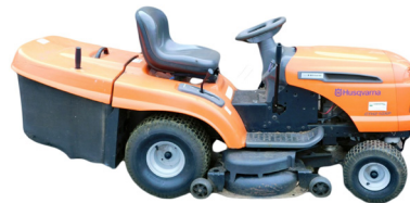
A Husqvarna CTH 210 XP petrol ride on mower , with Kawasaki engine and six speed gears. SOLD for £400