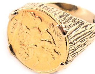
A replica Edward VII half gold sovereign dress ring , the replica coin dated 1907, in rubbed bark effect yellow metal band stamped 9ct, ring size Q½. SOLD for £250