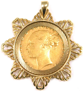
A young Victoria head full gold sovereign pendant , dated 1876, in a 9ct gold star mount, 12.3g all in. SOLD for £440