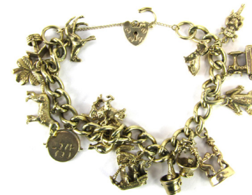
A 9ct gold charm bracelet , with fifteen various charms, safety chain and padlock clasp, 62.6g all in. SOLD for £1,000