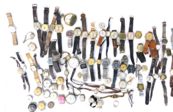
A group of wristwatches and pocket watches , to include Avia, Aerolux, Ingersoll, Buren, Medana, and others. (1 box, AF) SOLD for £340