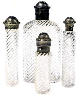
Four Victorian cut glass flasks , with Gothic silver mounts and hinged lids, the flasks of fluted form, mounts and lids with textured decoration, bearing embossed monograms, Thomas Johnson I, London 1873. SOLD for £300