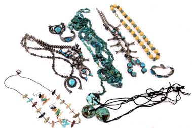
A group of Navajo and other turquoise set jewellery, including necklaces, bangles and pendants. (a quantity) SOLD for £400