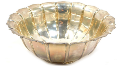
A George V silver rose bowl , with a fluted and reeded design, maker EB Limited number 562, London 1919, 24cm diameter, 19.85oz. SOLD for £310