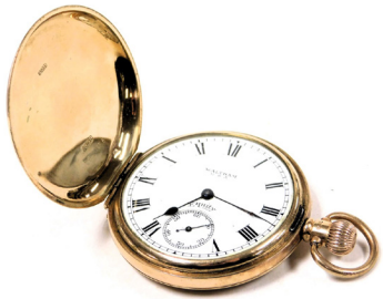
A George V 9ct gold cased hunter pocket watch , circular enamel dial bearing Roman numerals, subsidiary seconds dial, Waltham Equity movement, keyless wind, the case of plain form, Birmingham 1922, 93.1g all in. SOLD for £600