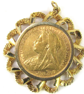
A Victorian gold full sovereign 1900 , spectacle set to a 9ct gold pendant mount, 12.7g all in. SOLD for £440