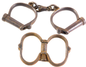
A pair of Hiatt late 19thC police handcuffs , numbered 231, and another pair of handcuffs. (2) SOLD for £550