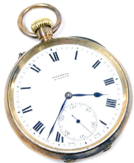
A gentleman's 9ct gold cased pocket watch, Mansell of Lincoln, open faced, keyless wind, circular enamel dial bearing Roman numerals, subsidiary seconds dial, S & Company movement, the case of plain form, 77.7g. SOLD for £360