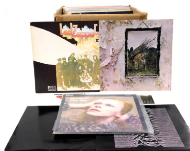
LPs, 1960s and later rock and pop, including Led Zeppelin, Joy Division, the Beatles, Pink Floyd, The Kinks, Bob Dylan, ELO and the Rolling Stones. SOLD for £240