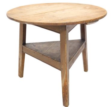
A 19thC pine cricket table , the two piece circular top on a triform scumbled base, with undertier (AF) 68cm high, 83cm wide. SOLD for £550