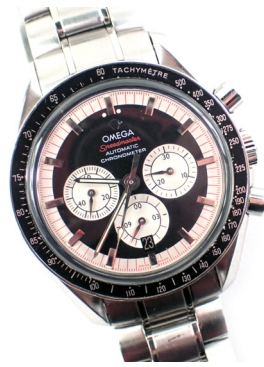
An Omega Speedmaster automatic chronometer gentleman's wristwatch , with a silver and blackened dial with three subsidiary dials and date aperture, with black outer wind border, from the Michael Schumacher The Legend collection. (AF) SOLD for £2,400