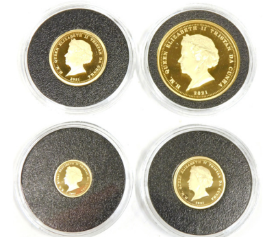
A Harrington and Byrne Tristan Da Cunha Elizabeth II 2021 four gold coin collection set, Double Laurel, 16g, Laurel, 8g, Half Laurel, 4g, Quarter Laurel, 2g, cased. SOLD for £1,020