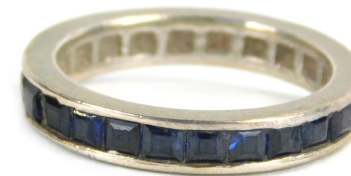
A sapphire full eternity ring, white metal, unmarked, 3g all in. SOLD for £240