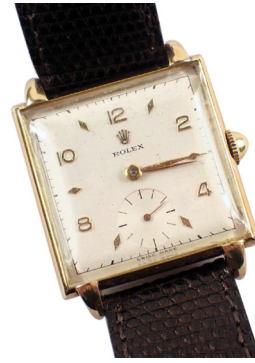
A late 1940s Rolex gent's wristwatch , with square watch head and a white interface with seconds dial and gold hands, numbered 498641, 4330, yellow metal stamped 14k 585, on a later brown leather strap, the dial 2.5cm diameter, with a seventeen rubis movement, 2.72g all in. SOLD for £2,600