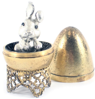
A Stuart Devlin silver parcel gilt Mad March Hare egg , the brushed egg opening to reveal a silvered hare, numbered 159 to underside, London 1973, with unmarked silver gilt coloured stand, 6.40oz, 7cm high, boxed with certificate, limited edition number 207/300. SOLD for £200