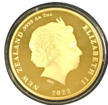
A Reserve Bank of New Zealand Elizabeth II £10 gold coin 2022, 2oz, cased. SOLD for £2,400