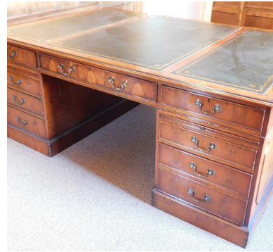
A 20thC yew partner's desk, the top with three green gilt tooled leather insets, with a moulded edge, with an arrangement of four drawers, sliding shallow drawer and two faux drawer cupboards to each side, on a plinth base, 75cm high, 180cm wide, 127cm deep. SOLD for £240