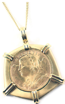
A twenty franc gold coin pendant and chain , the coin in a yellow metal mount marked UC, on a fine link neck chain stamped 750 Italy, the chain 54cm long, 18.3g all in. SOLD for £550