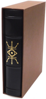
Chumbley (Andrew D). The Dragon-Book of Essex , Grimorium Synomosia Dracotos, first deluxe limited edition 104-196, with slipcase. SOLD for £800