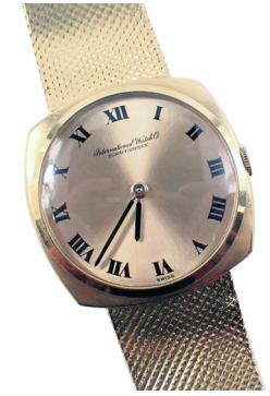
An IWC (International Watch Company) gentleman's wristwatch , with a square case and circular dial with Roman numerals, with an original 18ct gold strap, stamped IWC 18 etc., 68.9g all in, the dial 26mm diameter, the case 30mm wide. (Strap AF) SOLD for £1,700