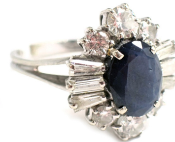
A sapphire and diamond cluster ring , the oval sapphire in claw setting, 9.4mm x 7.2mm x 3.4mm approx 1.84ct, surrounded by an arrangement of diamonds, white metal stamped 750, cut, 5.5g all in. SOLD for £700