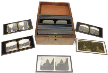
A group of late 19thC Grand Tour stereoscopic slides, views of France, Italy, The Alps, etc., mahogany boxed. SOLD for £420