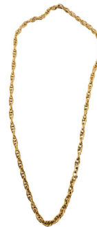
A fancy link neck chain, of multi link crossover design, with etched links, yellow metal unmarked, 60cm long, 30.2g. SOLD for £260