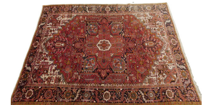
A Persian Heriz carpet , with a design of medallions, flowers, etc., in predominantly red on a cream ground, one wide and two narrow borders, 416cm x 313cm. SOLD for £600