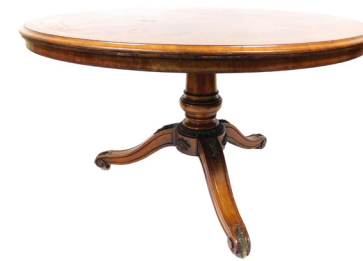
A Victorian walnut circular breakfast table probably by Holland & Sons, 130cm diameter. SOLD for £400