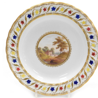
A late 18thC Crown Derby porcelain plate from The Blenheim Service, c1790, painted by George Robertson, with a view "near Bakewell, Derbyshire", painted marks, 22cm wide. SOLD for £200