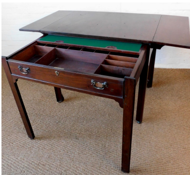
A George III mahogany architect's table, the rectangular top with drop leaves, with pull out front section of a false drawer with baize lined sliding interior revealing recesses on brass castors, 84cm high, 93cm wide, each drop leaf section 24cm, 66.5cm deep. SOLD for £500