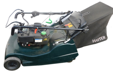
A Briggs and Stratton Hayter Harrier 56 petrol mower. SOLD for £500