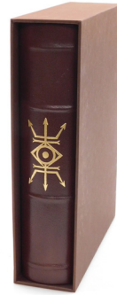
Chumbley (Andrew D). The Dragon-Book of Essex, Grimoirium Synomsia Dracotaos, first limited edition 18/808, published by Xoanon 2014, with slip case. SOLD for £900