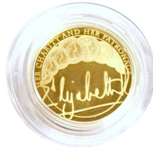
The Royal Mint Elizabeth II 2022 £25 gold coin, 39.94g, cased. SOLD for £1,425