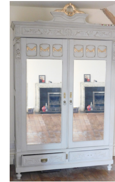
A 19thC French gilt and grey painted pine double wardrobe, with a shaped crest applied with floral wreath above a frieze carved with leaves, flanking a paterae and two mirrored doors enclosing hanging rail, with two drawers to the base (missing one handle), on bun feet, 240cm high, 148cm wide, 58cm deep. SOLD for £300