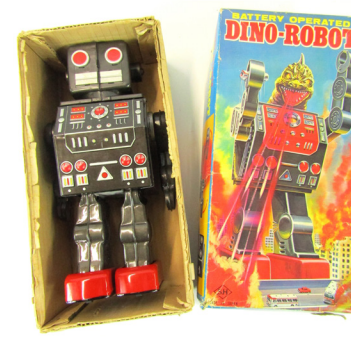
A Japanese Horikawa tin plate battery operated Dino-Robot, with automatic action, in black and red, 27cm high, boxed. SOLD for £420