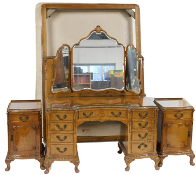
A George II style walnut and burr walnut bedroom suite, comprising dressing table with triple shield shaped mirrored back with bevelled edges, the inverted base with a carved border with an arrangement of drawers, on short carved cabriole legs with pad feet, 56cm high, 123cm wide, 57cm deep, a pair of similar bedside cabinets with a slide drawers and panelled door, 73cm high, 38cm wide, 42cm deep, and a bed head and associated frame, 139cm wide. SOLD for £300