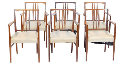
A set of six mid century Gordon Russell rosewood carver dining chairs, each with a slatted back, over stuffed seat, on square tapering legs. SOLD for £240