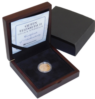
A Queen Elizabeth II Gillick full gold sovereign 1957, with certificate, boxed, 8.0g. SOLD for £330