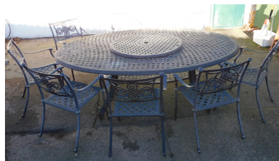
A cast metal garden table, with oval lattice work top and under tier, raised on four out swept legs, 66cm high, the top 246cm x 173cm, together with eight matching armchairs. SOLD for £650