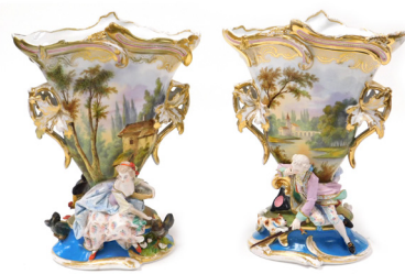
A pair of rococo style brass twin branch electric wall lights, 32.5cm high. SOLD for £400