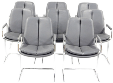
A set of eight late 20thC metal framed Eleganza type armchairs, in the manner of Tim Bates for Pieff, with grey leather seats and backs. SOLD for £440