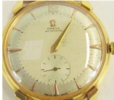
An Omega gentleman's automatic wristwatch, with a silvered dial and baton outer border, subsidiary seconds dial, in yellow metal case stamped 18ct, movement number 10974433, on a 9ct gold tapered block link bracelet with safety fastener, Birmingham 1960, watch head 3cm diameter, 59.4g all in. SOLD for £1,400