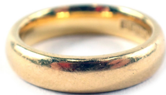
A 22ct gold wedding band , of plain design, ring size L, 8.7g. SOLD for £320