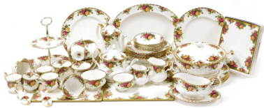
A Royal Albert porcelain Old Country Roses pattern part dinner, tea and coffee service. SOLD for £340