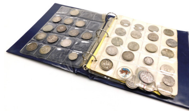
An album of George III and later silver and copper coinage, including George III and Queen Victoria silver crowns, half crowns, shillings and two shillings. SOLD for £600