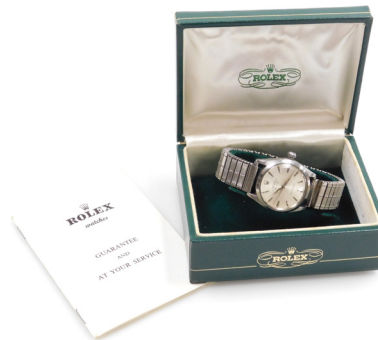
A Rolex gentleman's stainless steel cased Oyster Perpetual Air King wristwatch, circular silvered dial, centre seconds, model no.1023, serial no. 985829, purchased 24/10/66, boxed with guarantee. SOLD for £1,400