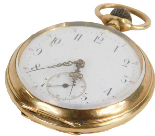
A gentleman's open face pocket watch, keyless wind, the white enamel Arabic numeral dial bearing Arabic numerals, subsidiary seconds dial, the case of plain form marked 0.585, number 14612, with plain cuvette, 92.1g gross. SOLD for £650