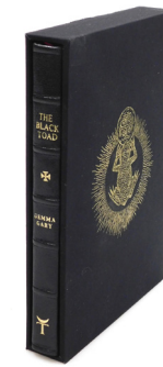
Gary (Gemma). The Black Toad, first fine limited edition 80/83, with slipcase. SOLD for £320