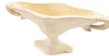
A Constance Spry Fulham pottery two handled urn , with glazed interior, impressed marks to underside, 46cm wide. (AF) SOLD for £340