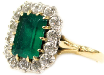
An 18ct gold emerald and diamond ring, the rectangular cut emerald in a surround of brilliant cut diamonds, emerald approximately 0.85 carats, diamonds approximately 0.6 carats, size P, 4.4g. SOLD for £750