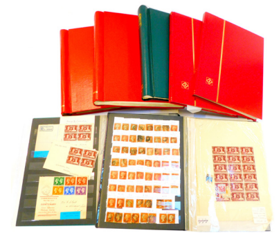
GB. - QV - QEII. A reasonably comprehensive GB collection, including 1d black, 1d reds and 2d blues. A tied 1d black with red Maltese Cross cancel, many tied 1d red and other Victorian issue covers, a 1d red collection of all plates (except 77), and a separate collection of 1d red regional cancellations, some other reasonable Victorian issues, a few blocks, c20% mint, mostly hinge-mounted, contained in seven albums. SOLD for £330