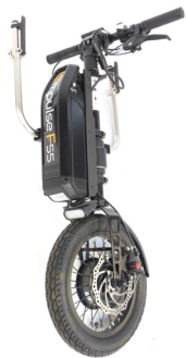
A Sun Rise Medical Empulse F55 wheelchair powered pulling device, with instruction manual. SOLD for £360