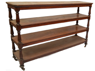
A Victorian mahogany serving buffet, with four rounded rectangular platforms joined by tulip carved uprights, on brass and ceramic castors, 118cm top serving height, 190cm wide, 50cm deep. SOLD for £550