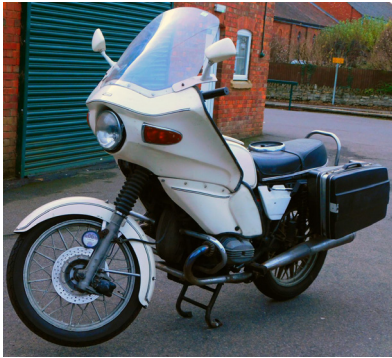
A BMW R75/7 motorcycle, registration WUA 624S, petrol, 746cc, first registered 01/09/1977, MOT expired 01/07/2010, white, 35,503 registered miles, V5, keys. SOLD for £1,500