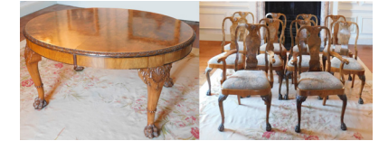
A George II style walnut extending dining table, the oval burr top with a carved edge, raised on four shell and scroll carved legs with raised beading, on hairy paw feet, 75cm high, the top 121cm x 150cm, with winder, together with a set of ten Queen Anne style walnut dining chairs, including two carvers, all with a solid vase splat with applied shell decoration, drop in floral tapestry seats raised on front scroll and shell carved cabriole legs on hairy paw feet (8+2). SOLD for £220