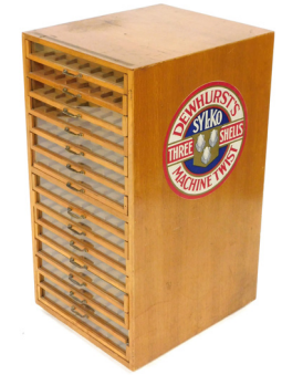
An early 20thC oak shop display chest, for Dewhurst's Machine Twist Sylko, Three Shells, of rectangular section, with fourteen glass fronted drawers, 76cm high, 36.5cm wide, 45.5cm depth. SOLD for £220