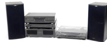
A Technics music system, comprising turntable SL-BD22D, compact disc player SL-PS7700A, stereo control amplifier SUC800U, and stereo power amplifier SE-A800S, together with a pair of B&W speakers. SOLD for £320