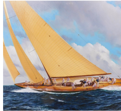
SW or WS monogrammist (20thC). Racing Yachts, oil on canvas, monogrammed, 70cm x 89.5cm. SOLD for £260