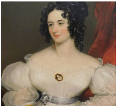
18thC British School. Half length portrait of a lady, oil on canvas, 88.5cm x 68cm. Stencil marks verso. SOLD for £650