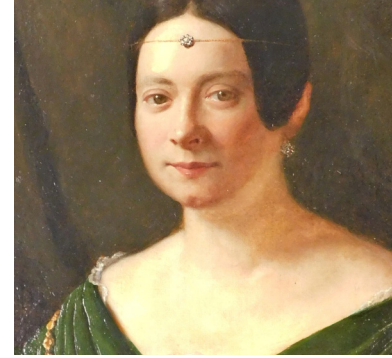
18thC/19thC School. Head and shoulders portrait of a lady, oil on canvas, 57.5cm x 47cm. SOLD for £420