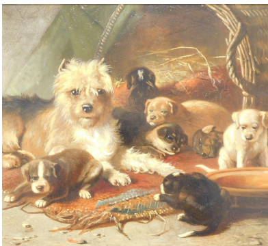
B.W.G. (19thC School). Terrier? with puppies, oil on panel, signed, 23cm x 37cm. SOLD for £200