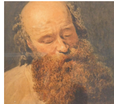
19thC School. The Death of Rossetti, watercolour, titled and dated 1882 on mount, 22cm x 18cm. SOLD for £420