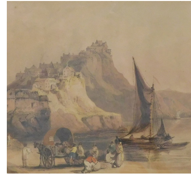
Francis Nicholson (1753-1844). Robin Hood's Bay, Yorkshire, watercolour, attributed and titled verso, 33cm x 50cm. SOLD for £300