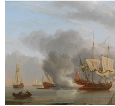
Peter Monamy (1685-1749). Man of War entering Portsmouth harbour, oil on board, attributed and titled on mount, 32cm x 45cm. Label verso The Parker Gallery London. SOLD for £2,700