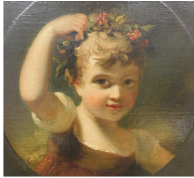
Richard Wilson (1714-1782). The Holly Wreath, oil on canvas, attributed and titled on mount, 41cm x 41cm. Stencil marks verso. SOLD for £600