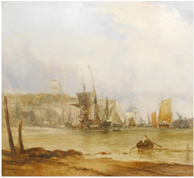
George II Chambers (1830-c.1890). Shipping scene off the coast, oil on canvas, signed and dated 1856, 33.5cm x 53.5cm. Label verso The City Gallery London. Stencil marks verso. SOLD for £320