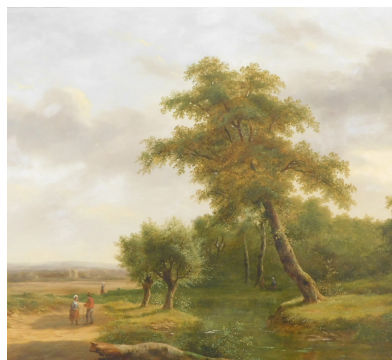
Jean-Baptiste Coene (1805-c1850) Figure on river landscape, oil on panel, 45.5cm x 58cm. Label verso W.H. Patterson London. SOLD for £220