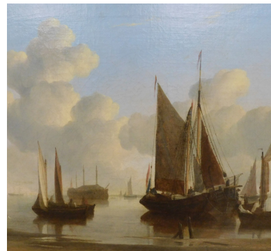
19thC British School. Fishing boats and masted ships off the coast, oil on canvas, 34.5cm x 45.5cm. SOLD for £300