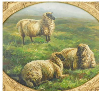
Thomas Sidney Cooper (1803-1902). Sheep, oil on board, signed and dated (18)71, 38cm x 48cm. SOLD for £400