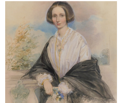
George Richmond (1809-1896). Josephine Butler, watercolour, attributed and titled on mount, 52cm x 39.5cm. SOLD for £150