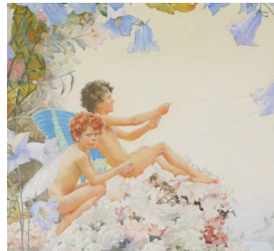
Arthur Herbert Buckland (1870-?). Fairy bells, watercolour, signed and titled verso, 44.5cm x 61cm. Artist label verso. SOLD for £140