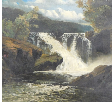
19thC British School. Waterfall, oil on canvas, indistinctly signed and dated (18)85, 34cm x 45cm. SOLD for £140