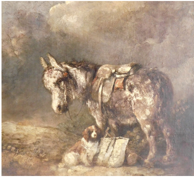
19thC School. Pony and dog, oil on canvas, 48cm x 40cm. SOLD for £200