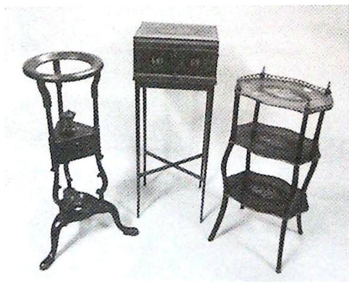
Left to Right: Lots 621, 620, 622