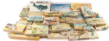
Frog, Airfix, Revell and other model aeroplane kits. (1 box) SOLD for £240