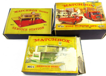
Lesney by Matchbox Series stations, comprising Service Station Esso MG1, Service Station BP, and Fire Station set G10, boxed. (3) SOLD for £140