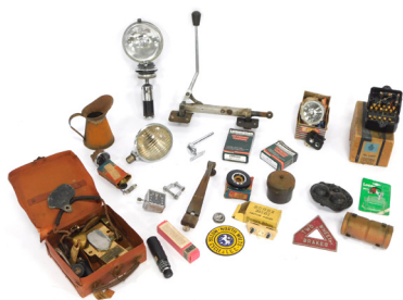
Automobile parts and accessories, a lumenition optronic ignition autocar, a Bon mini switch panel, travels cases, lights, etc. (a quantity). SOLD for £220