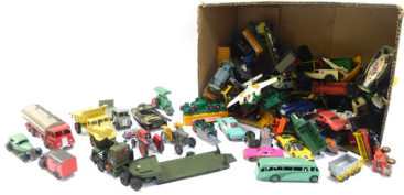
Dinky and others diecast vehicles, play worn, armoured vehicles, farm vehicles, trucks, etc. (1 box) SOLD for £140