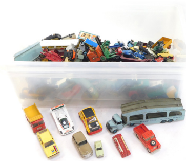
Dinky Corgi and other diecast vehicles, play worn, Dinky Toys car transporter loading ramp, agricultural vehicles, cars, etc. (1 box) SOLD for £140