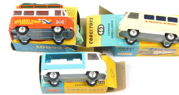
Three Corgi Toys diecast vehicles, comprising 466 Commer milk float, 508 Commer Holiday Camp bus, and 463 Commer Ambulance, boxed. (3). SOLD for £120