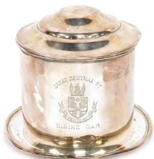
A Walker & Hall silver plated biscuit barrel, on integral stand, engraved with the coat of arms and motto for the Great Central Railway, Dining Car, 16cm high. SOLD for £200