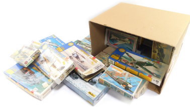
SMER Airfix Matchbox and other model kits. (1 box) SOLD for £150