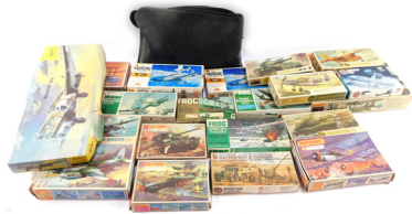
Matchbox Airfix and Revell models, aircraft, Army, Navy and others. (1 box) SOLD for £140