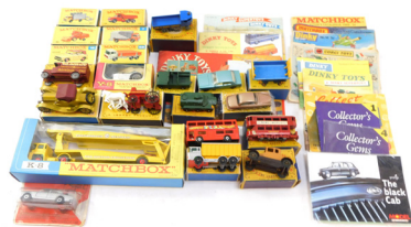
Matchbox Series Model cars, comprising Y4, Y8, No 7, 18, 65, 4, 37, 12, Y6, 54, 48 (x2), 47, 17, 28, and K8, boxed, and various Matchbox pamphlets. (1 tray). SOLD for £180