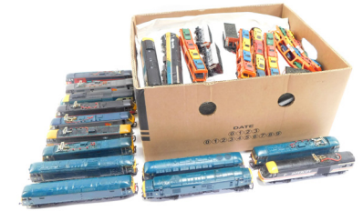
Plastic kit built carriages, (AF). (1 box) SOLD for £180