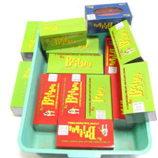
Britbus model buses, 1:76 scale, in presentation packs, to include Leyland Titan PD2, MCW Midi Bus, Double Decker door bus, Scania Metropolitan, Guy Arab 3, AEC Short Swift (x2), Erdington, N6203 and others. (1 tray) SOLD for £150