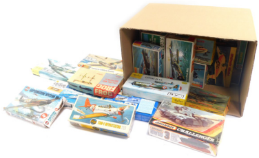
Riko and Airfix model planes, sea planes, frog models, tank, etc. (1 box) SOLD for £190