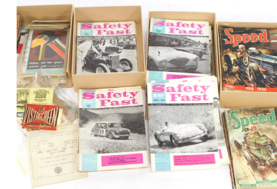
A quantity of magazines, relating to Automobile Speed, Safety Fast and others. (6 boxes). SOLD for £240