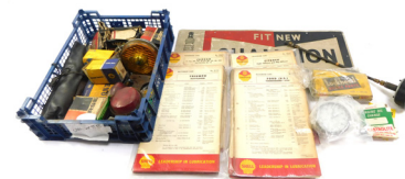
Automobile parts and accessories, to include brake lights, Lockhead brake parts, spark plugs, Morse Automotive equipment, Shell passenger cards Triumph, Jaguar, Ford, and other servicing guides and a Fit New Champion Every Ten Thousand Miles advertising sign. (1 box). SOLD for £150