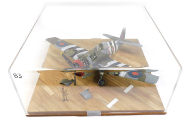
A diorama model of a Hawker Tempest, for JB131, 1:32 scale, in Perspex case, 22cm high, 51cm wide, 51cm deep. SOLD for £160