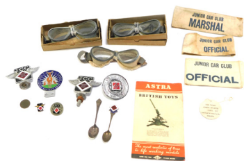
Automobile badges and trinkets, comprising Junior Car Club official armbands, Junior Car Club car badges and pin badges, commemorative spoons, three pairs of driving goggles and an Astra British Toys Microscope information pamphlet. (1 tray). SOLD for £400