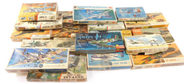
Airfix and other kit built model aircraft. (1 box) SOLD for £190