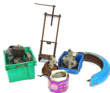
A Bantam BSA Motorcycle wheel arch, various engines, automobile parts, etc. (3 boxes). SOLD for £250