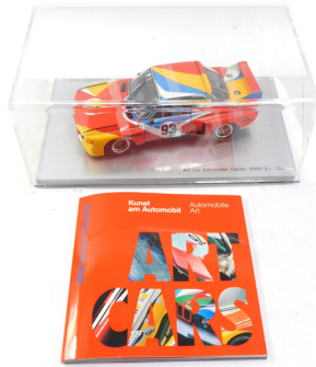
A Kunst Automobile Art BMW Art Car Museum Edition, boxed. SOLD for £160