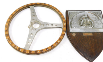
A motorcycle racing plaque for Newark & District MCC Club, won by R H Smith, 28/11/26, and a further presentations, silver plated on a oak shield mount, together with a steering wheel. (2). SOLD for £150