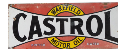
A Wakefield Castrol Motor Oil enamel sign, on a red ground with white and yellow banding, 31cm x 76cm. SOLD for £160