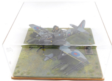
A diorama model of a Westland Whirlwind aircraft, 1:32 scale, in perspex case, 20cm high, 39cm wide, 38cm deep. SOLD for £140