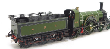
A kit build OO gauge sterling single locomotive and tender, GNR A1, in green livery 4-2-2, 1. SOLD for £380