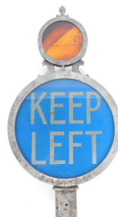
A Solenoid Ltd road sign, with central blue section marked Keep Left, and an orange beacon top, 62cm high, 31cm diameter. SOLD for £260