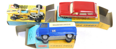
Three Corgi diecast vehicles, comprising Ford Consul Cortina Super Estate No 491, 462 model car, and 159 Cooper Maserati F1, boxed. (3) SOLD for £200