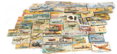
Airfix and other kit built model aircraft and ships. (1 box) SOLD for £420