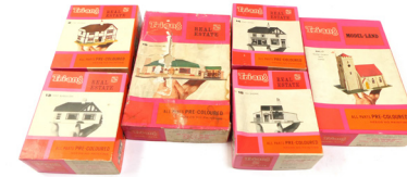
Tri-ang Real Estate Buildings, comprising 15 Tea Shoppe, 2 The Grange, 13 Kent Bungalow, 14 Post Office, RML 17 Village Church with chimes, and 10 Hollywood Bungalow, boxed. (6) SOLD for £130