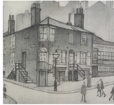
Laurence Stephen Lowry (1887-1976). Great Ancoats Street, artist signed limited edition print, number 652/850, watermarked, 27cm x 36cm. SOLD for £1,300