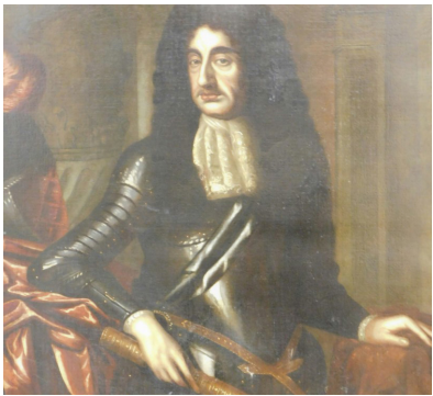
Manner of John Riley. Portrait of Charles II three quarter profile wearing armour, oil on canvas, unsigned, 127cm x 96cm. SOLD for £1,200