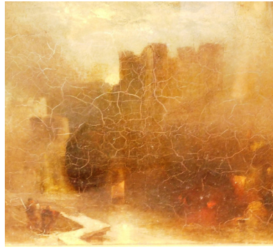
Manner of Turner (19thC School). Corfe Castle, oil on canvas, attributed to the frame, stencilled numbers to stretcher, 22cm x 28cm. SOLD for £500