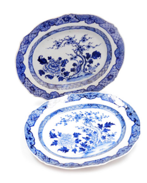
A pair of late 18thC Chinese export blue and white meat platters, of oval form decorated with a tree in blossom and peonies, 32cm wide. SOLD for £190