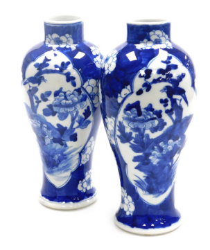
A pair of 19thC Chinese porcelain blue and white vases, of baluster form with a raised neck, each decorated with reserves to front and verso of a bird on flowering branch, on a cracked ice ground decorated with prunus blossom, Kangxi four character mark, 26cm high. SOLD for £280