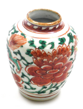
A 17thC Chinese porcelain wucai jar, of cylindrical tapering form with a raised neck, decorated with peonies and dragons in coloured enamels, circa 1660, paper label for Artemesia Alresford Hants to underside, 12cm high. SOLD for £220