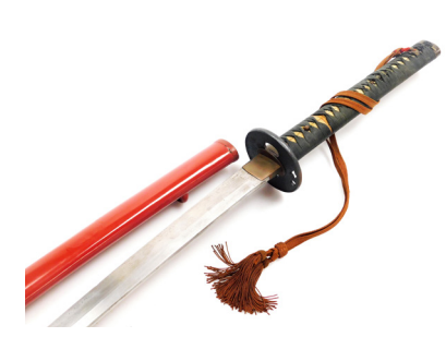
A 20thC Chinese porcelain moon flask, with sang de boeuf glaze and trumpet top, 20cm high, with hardwood stand. SOLD for £240