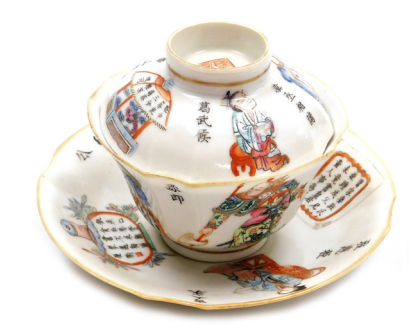
A Chinese porcelain tea bowl cover and saucer, decorated with deities and reserves of calligraphic script, four character Qianlong mark, but later. SOLD for £550