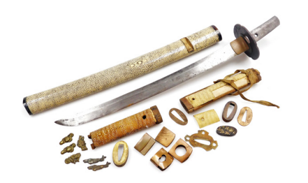
A Japanese wakizashi, with tsuba and shagreen scabbard, 45cm long overall, a group of sword furniture and partial shagreen sword hilts, 19thC or earlier (AF). SOLD for £200