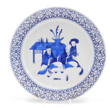
A 19thC Qing dynasty blue and white plate, decorated centrally with scholars in front of a large vase and table, within a repeating arabesque border, 25cm wide. SOLD for £140