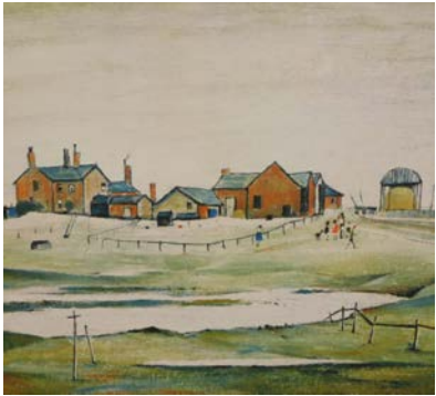
Laurence Stephen Lowry (1887-1976). The Farm, artist signed limited edition print, 1974 Venture prints with KBD blind stamp, 41cm x 48cm. SOLD for £2,300