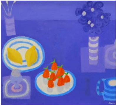
Alan Furneaux (b.1953). Strawberries and Lemons, oil on canvas, signed and titled verso, 59.5cm x 74.5cm. Label verso: Reynolds Fine Art, Essex. SOLD for £500