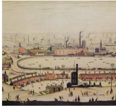
Laurence Stephen Lowry (1887-1971). The Pond, artist signed limited edition print, AFK blind stamp, signed to the mount, 44cm x 54cm. SOLD for £5,800