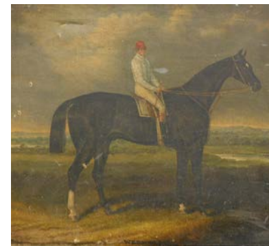
Circle of Samuel Spode. Wedding Peal, racehorse with jockey in white silks, oil on canvas, signed and titled, 52cm x 60cm. SOLD for £650