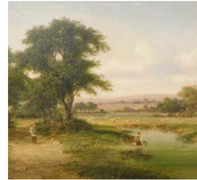
Attributed to Walter Heath Williams (act.1841-c.1876). Landscapes with figures in the foreground and sheep in the distance, oil on canvas, - pair, 46cm x 66cm, gilt framed. SOLD for £1,000