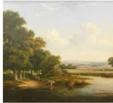
Attributed to Walter Heath Williams (act.1841- c.1876). Extensive landscape with five figures crossing a stream on a pathway and the riverbank, cattle in the foreground of a rolling landscape with trees, oil on canvas, 66cm x 102cm. SOLD for £600