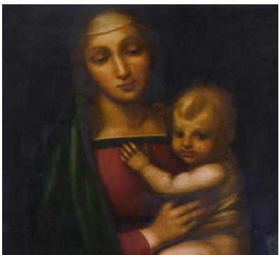
Italian School. Virgin and child, oil on canvas, indistinctly titled verso, 86cm x 58cm. SOLD for £300