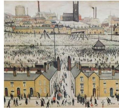
Laurence Stephen Lowry (1887-1971). Britain at Play, artist signed limited edition print, PBC blind stamp, signed to the mount, 45cm x 59cm. SOLD for £5,500