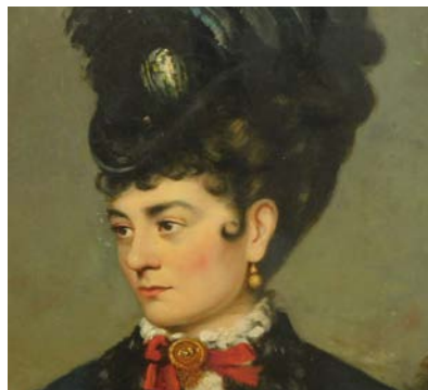
19thC English School. Figure of a lady facing sinister, wearing elaborate feather hat and neck jewel, shoulder portrait, oil on canvas, 60cm x 45cm. SOLD for £380