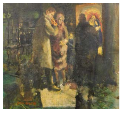
John Bratby (20thC). Figures in doorway, oil on board, signed, 59.5cm x 49.5cm. SOLD for £280