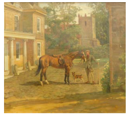
20thC English School. Woolbeding House, Pulpero, Chutney and Downes, oil on canvas, indistinctly signed, dated and titled on mount, 62.5cm x 75.5cm. SOLD for £380