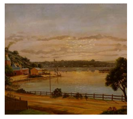
19thC/20thC Australian School. A summer morning Swan River (Perth), Western Australia, oil on canvas, signed and dated (18)95, titled verso, 49.5cm x 74.5cm. Label verso Wye Art Gallery. SOLD for £4,800