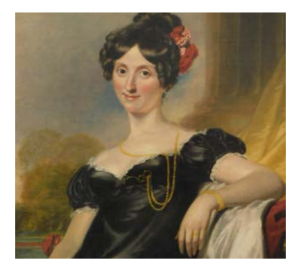
19thC Salisbury School. Portrait of a lady, quarter profile, dressed in finery holding a note, oil on canvas, unsigned, 91cm x 70cm. SOLD for £500