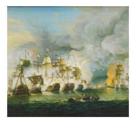
Edgar S. Nucum (20thC). Man-O-War ships in battle, oil on board, signed, 59cm x 89cm. SOLD for £200