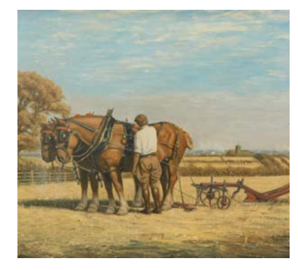
Robin Wheeldon (b.1945). October morning, Suffolk mares with Cooke (Lincoln) plough, oil on board, signed, dated 1980, and titled verso, 44cm x 60cm. SOLD for £240