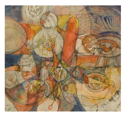
Aimarh. Abstract study, watercolour, signed and dated (19)61, 45cm x 59.5cm. SOLD for £1,600