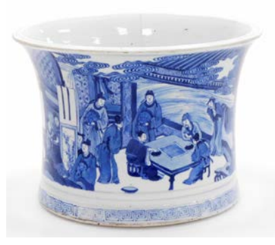
A large Chinese blue and white porcelain brushpot, of waisted form decorated with a continuous scene of scholars playing a game of go while attendants look on, further adult figures and children playing in the garden, Greek key fret border at the base; Kangxi style. SOLD for £16,000