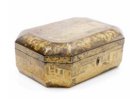
A 19thC octagonal Chinese export lacquer box, decorated in gilt with panels of figures and buildings with background of dragons. Removable interior tray, 12cm high, 26cm wide, 21cm deep. SOLD for £180