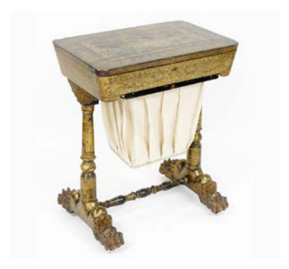
A 19thC Chinese export black lacquer work table, with rounded rectangular chinoiserie decorated hinged top enclosing a fitted interior with various ivory and bone implements, compartments with shaped ivory lids, etc SOLD for £300