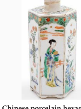
A Chinese porcelain hexagonal tea caddy, decorated with panels of vases and figures beside a fence, decorated in famille verte palette, unglazed base, 18thC, 18cm high. SOLD for £750