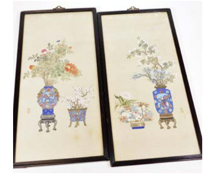
A pair of hardwood framed Chinese watercolours, of vases containing blossoming flowers and branches,19th/20th century, 67cm x 32cm. (2) SOLD for £550