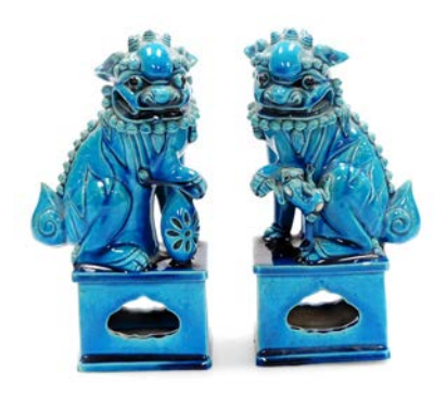
A pair of Chinese turquoise glazed pottery dogs of fo, each on shaped partially pierced bases, unmarked, 23cm high. (2) SOLD for £220