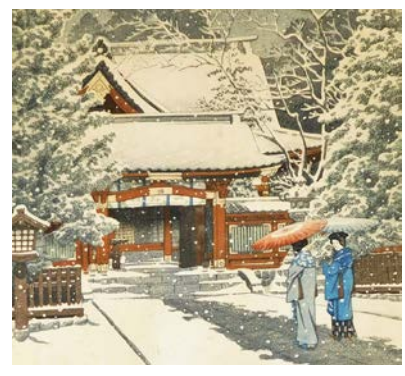
A Japanese woodblock print, Snow at Hie Shrine (Shato no yuki (Hie jinja) by Kawase Hasui (1931), 36cm x 25cm. SOLD for £480