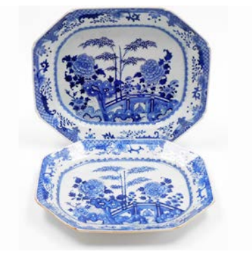
A duo of 18thC Chinese blue and white porcelain octagonal export meat plates, decorated with bamboo peony and other flowers beside a fence and flowers, shaped diaper and leaf borders, 46cm wide and 41cm wide.