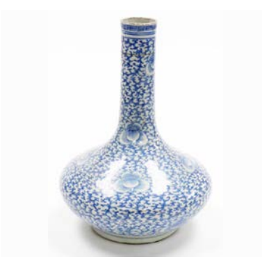
A Chinese porcelain blue and white bottle vase, with slender neck decorated with an all over design of scrolling peonies, unmarked, partial collectors label to base, probably 19th century. 31cm high. SOLD for £200