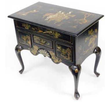
An early 20thC Oriental style black lacquer lowboy, decorated with gold figures on horseback with trees, flowers and sprays, with one large drawer, three smaller drawers, on splayed feet, 76cm high, 86cm wide, 51cm deep. SOLD for £340