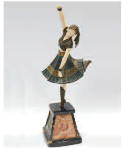
Art Deco dancer by Demetre H Chiparus SOLD for £15,000