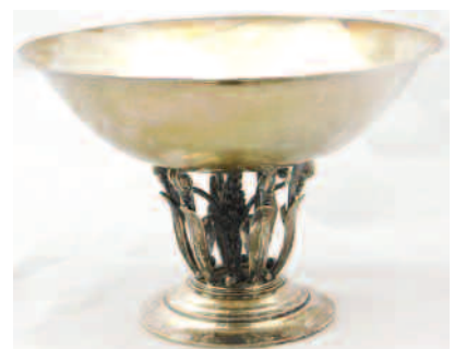
Silver tazza by Georg Jensen SOLD for £1,700