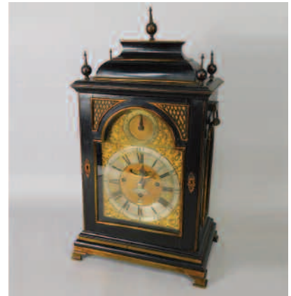
George III bracket clock by John Archambo SOLD for £5,000