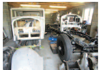
1935 Rolls Royce Phantom III SOLD for £16,000