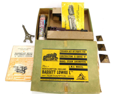
An O gauge model kit, a model steam locomotive LMS Mogul, by Bassett Lowke Ltd, boxed. SOLD for £100