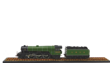
An O gauge Class A3 Flying Scotsman locomotive and tender, 4472, 4-6-0, apple green livery, with a section of track, together with Flying Scotsman locomotive bound magazines. (a quantity) SOLD for £150