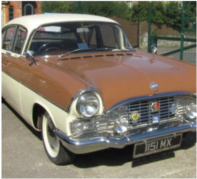
A 1962 Vauxhall Cresta, registration 1151 MX, 2651cc petrol, 95,637 recorded miles, registered 1.3.62, in brown and cream, V5 present. SOLD for £6,500