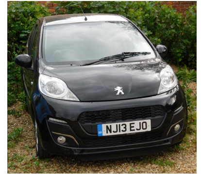
A Peugeot 107 Allure, registration NJ13 EJO, petrol, manual, black, 15319 recorded miles, first registered 03/04/2013, MOT expired 17/09/23, V5 present. SOLD for £2,900