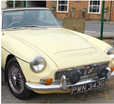
A 1968 MGC Roadster convertible, registration PWN 343G, in pale primrose yellow, with rare Lenham drophead conversion, renovated in 1997-1998 by Roger Taylor Classic Cars of Bournemouth. SOLD for £7,000