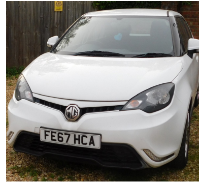
An MG 3 VTI, registration FE67 HCA, five door hatchback, petrol, white, 11,832 recorded mileage, first registered 14/11/2017, MOT expired 13/11/2022. V5 present. SOLD for £3,550