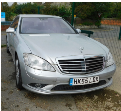
A 2006 Mercedes AMG S500 saloon car, registration HK55 LDX, 5.5 litre petrol, automatic, silver, 142,035 miles, last MOT expired September 2020. SOLD for £1,800