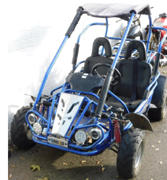
A Hammerhead petrol two seat go kart, with blue frame. SOLD for £400