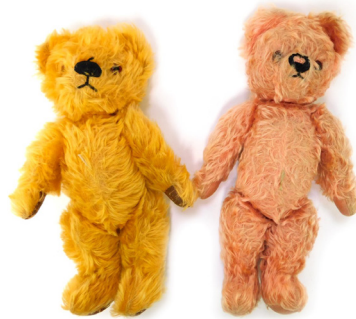
Two mid century Chad Valley Teddy bears, in yellow and pink, jointed, with fabric label to each foot, 33cm high. SOLD for £160