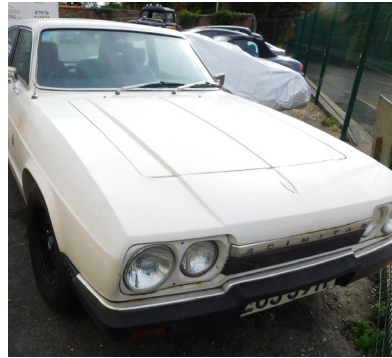
A 1976 Reliant Scimitar GTE auto two door saloon, registration LOJ 597P, 2994cc petrol, 28,234 recorded miles, V5 present, white, workshop manual and other printed material. SOLD for £2,000