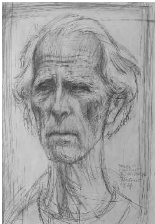
Portrait of John Piper