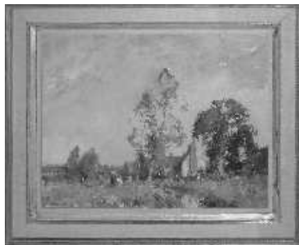
Edward Seago (1910 – 1974) sold for £29,000